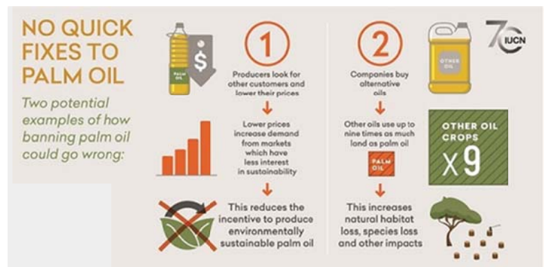
Banning palm oil could result in unintended negative outcomes for biodiversity.

To mitigate biodiversity loss, effective policies and programs are needed to stop the clearing of native tropical forests for new oil palm plantations. This includes policies which limit demand for palm oil for non-food uses (such as the new European Union policies limiting the use of palm oil for biofuel) or which protect forests and other ecosystems in producer countries. Importing country policies need to apply to all vegetable oils, not just palm oil, and must minimise the environmental cost of producing these vegetable oils. Policies in producing countries need to ensure that the production of palm oil abides by national laws and international conventions aimed at avoiding negative environmental impacts, such as the UN Convention on Biological Diversity.