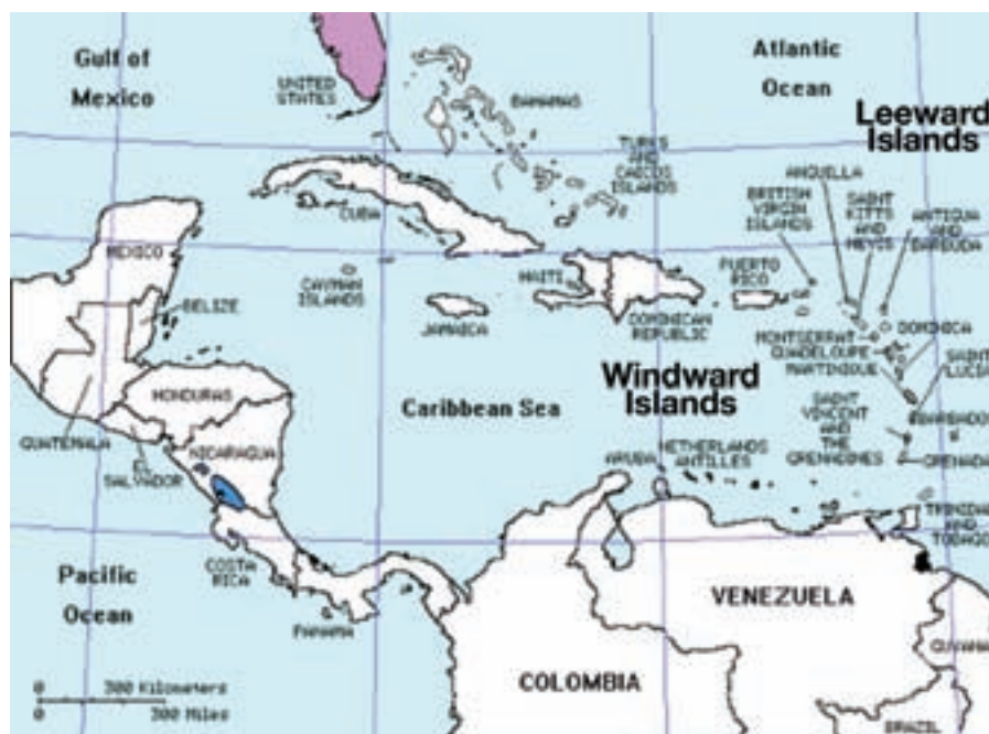
Figure 1. The Wider Caribbean

While this is a region of high ecological, cultural, political and economic diversity, the geographic scope of the study encompasses countries and territories