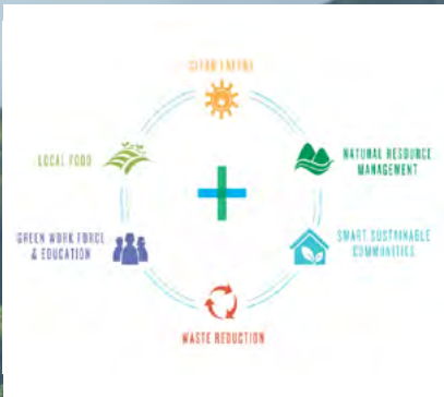
Aloha+ Challenge

Launched in 2014, the Aloha+ Challenge is a statewide sustainability commitment for the State of Hawai'i by the Governor, four County Mayors, Office of Hawaiian Affairs, State Legislature, and over 100 public-private partners across the state.