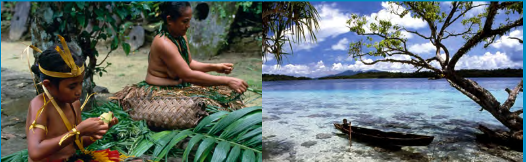
Federated States of Micronesia, Woman and girl weaving Areca palm leaves