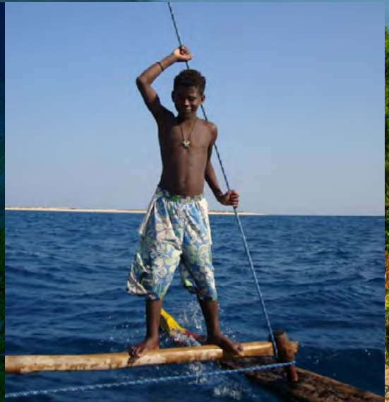
Young Fisherman in Madagascar

We invite you to meet colleagues, both old and new, who are on a similar island journey to sustainability at the 2016 IUCN World Conservation Congress.