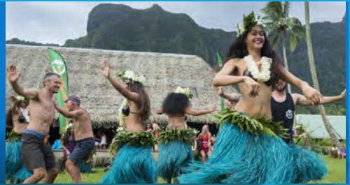
Traditional dance in French Polynesia