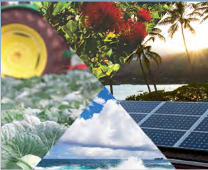
HGG Pinwheel

Hawai'i Green Growth (HGG) is an innovative public-private partnership that coordinates across government, the private sector, and civil society to achieve Hawai'i's 2030 statewide sustainability goals and serve as a model for integrated green growth. Hawai'i Green Growth convenes diverse partners to identify areas for joint actions, including shared measures, policy priorities, innovative finance mechanisms, and concrete projects to drive implementation on Hawai'i's 2030 goals.