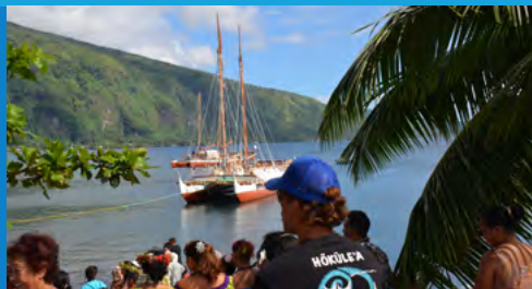
Arrival of Hawaiian pirogues (accompanied by Tahitian pirogue Faafaite)