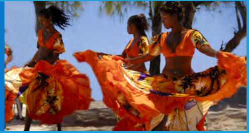
Traditional dancers from the Indianoceania