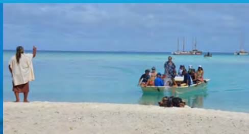
Punua welcomes the crews of Hokule'a and Hikianalia on its marae