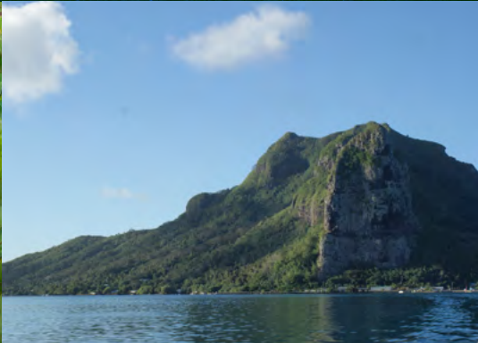
Maupiti, French Polynesia