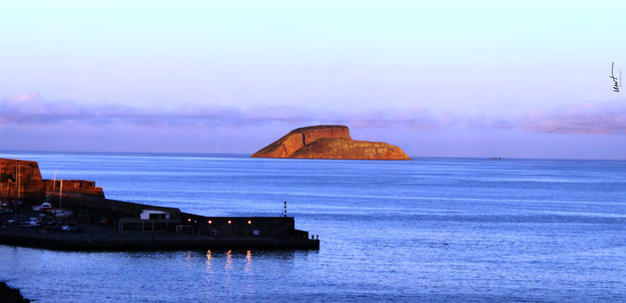
Sunset light on Ilhéus das Cabras natural reserve - Terceira Island - Azores