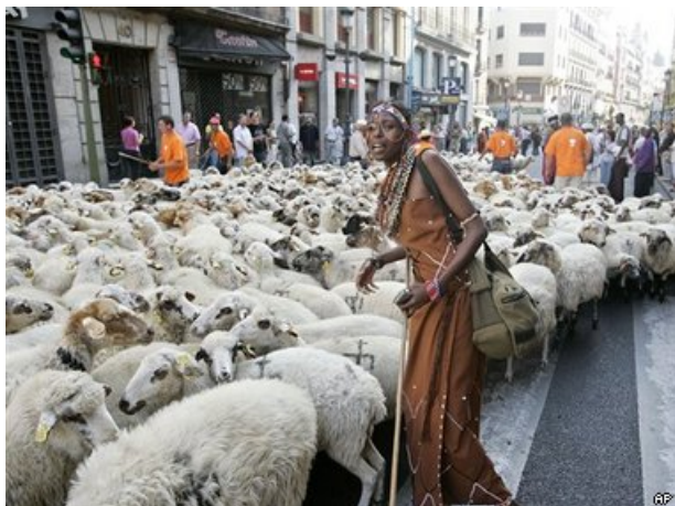
Photo: An African woman at the Segovia Gathering helps guide a flock of sheep through the streets of in Madrid, Sunday Sept. 9, 2007.

In Europe too, as movements in rural areas have been revitalised and increased in profile and strength, remaining shepherds and pastoralists have also mobilised themselves in order to highlight their needs and concerns. In Spain for example, an annual festival is held which highlights pastoral concerns and calls on authorities to protect 120,000 km of paths used for seasonal movement of livestock, from cool, highland pastures in summer to lower-lying ones in winter. Some of them are 800 years old. The festival which includes herding hundreds of sheep down the streets is held in Madrid which lies along two of the north-south routes. One of these dates back to 1372. In 2007 the protest coincided with a global gathering held in the country. A number of pastoralists attending the gathering also attended the protest. This included a pastoral woman from the Samburu who assisted the Spanish shepherds in their protest.