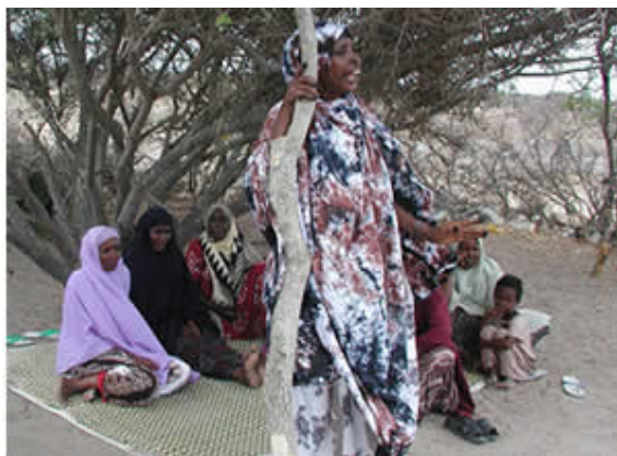
Photo: Women leading a discussion on food distribution (Kenya)

More recently, women often have been given a greater opportunity to be involved in food aid distributions (on the assumption that by doing so household members are more likely to benefit), and given the opportunity to sit on relief committees. Many women have taken up the positions with force for example in Garissa, where CARE Kenya through ECHO has been implementing a destocking programme (see Box 2.3).