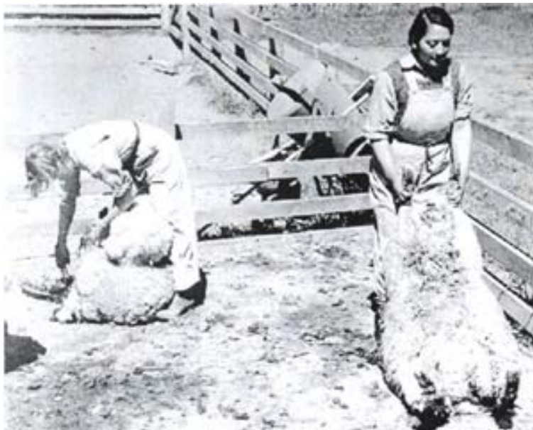
Photo: 'Women crutching sheep' in New Zealand in the 1940s (see file).

Processing tasks, such as slaughtering or hide processing, can be assigned exclusively to one or the other sex. For example, in most East African societies, men are responsible for slaughtering animals and extracting blood. But among the Maasai, although men and women deny it, women do slaughter cattle and small ruminants (Talle 1988). And amongst the Koochi of Afghanistan, men may slaughter the animal, but it is women who clean the internal organs and prepare the meat for cooking (Davis 1995). The processing and use of hides in Asia has always been men's work, in contrast with such as the Maasai and Barabaig of Tanzania, where women have sole responsibility for this task. It is often assumed that mainly men shear sheep, however as the photo below confirms (women 'crutching sheep' in New Zealand), this is not always the case.