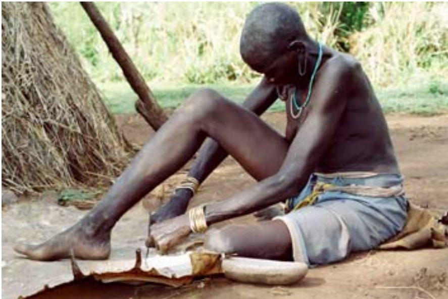
Photo: A Mursi woman preparing a new leather skirt. Shauna LaTosky 2007

Source: Shauna LaTosky, personal communication, 2008