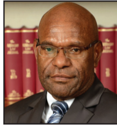
Justice Ambeng Kandakasi

Deputy Chief Justice, National and Supreme Courts