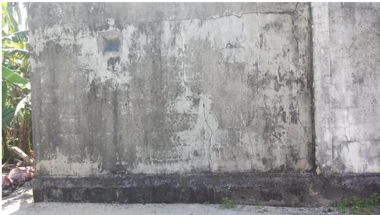
3. Household Lê Phước (7 x 3 m)