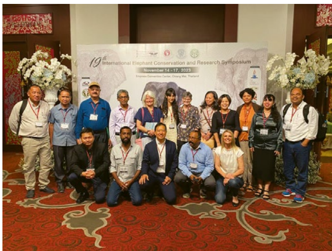
AsESG members at 19th IEF conference in Thailand