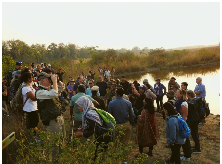
Field trip at Corbett during 11th AsESG meeting