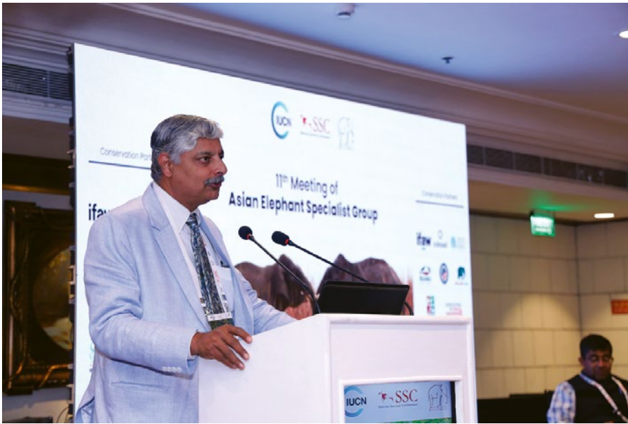
AsESG Chair at 11th AsESG meeting