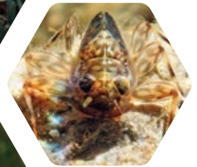
Mayfly nymph ( Ecdyonurus sp.)