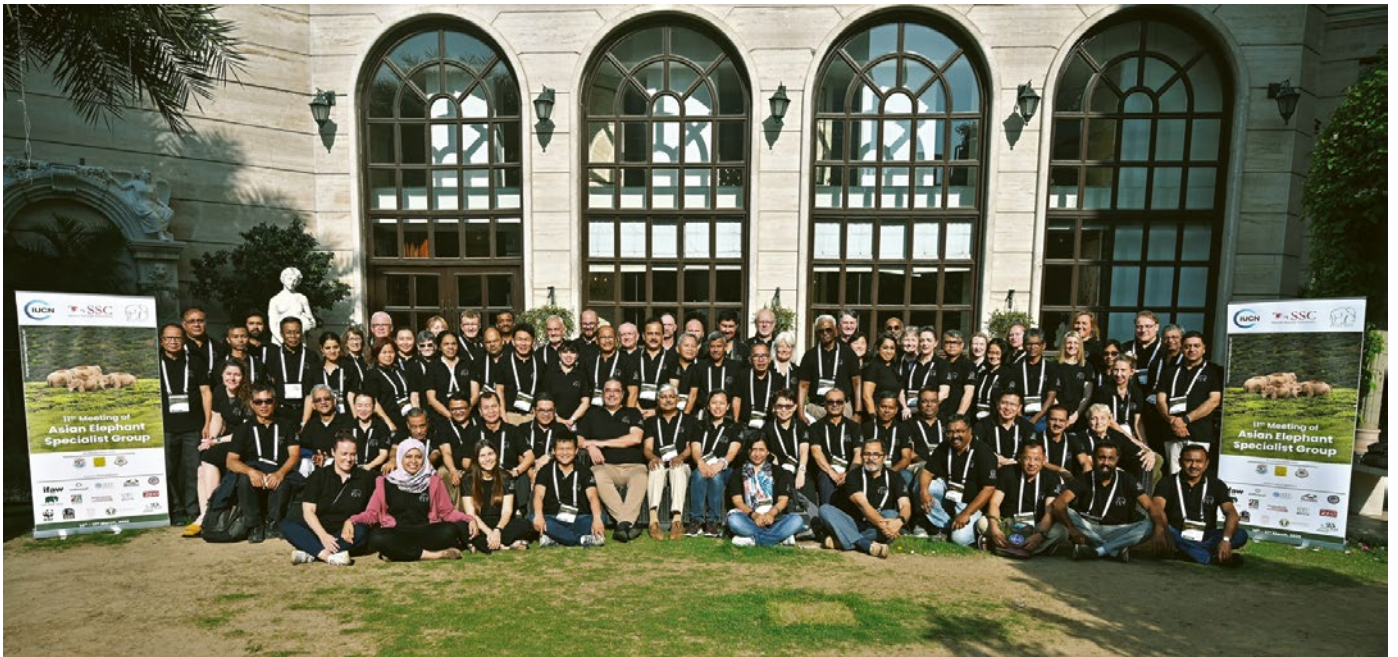
Group photo at 11th AsESG meeting