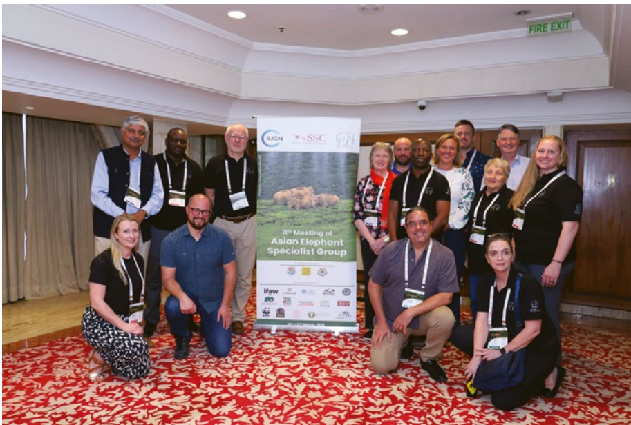
Conservation partners meeting