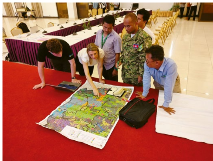
Consultation workshop- mapping elephant distribution in Cambodia