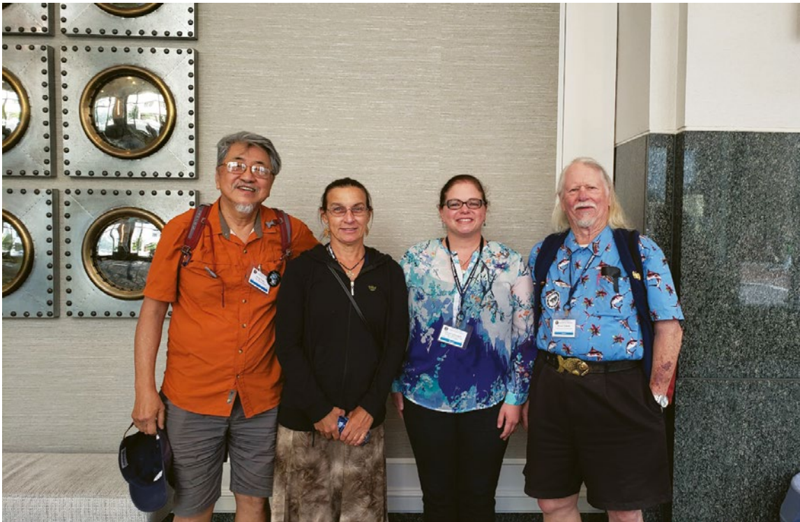
Joint Meeting of Ichthyologists and Herpetologists Meeting Norfolk July 2023