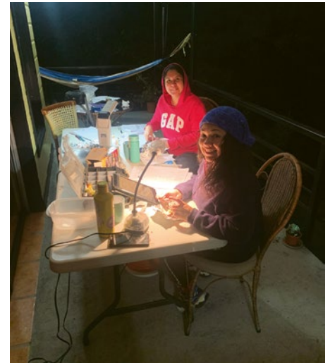
Building capacity, Costa Rica

Result description: Mushroom, Bracket, and Puffball Specialist Group members are active participants and presenters at conferences, workshops, and public events. Presentation topics included updates on biodiversity surveys, ecology, taxonomic treatments, conservation initiatives as well as general talks to the public, highlighting the importance of fungi and the need to conserve them.