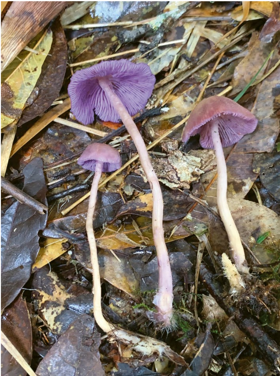
Laccaria gomezii , a species endemic to southern montane Quercus-dominated forests, Costa Rica