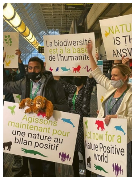
Demonstration at COP15 for an ambitious agreement