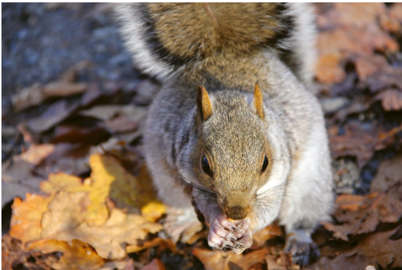
Eastern Gray Squirrel ( Sciurus carolinensis ), invasive in Europe

Number of country editors engaged with and recruited for support: 50