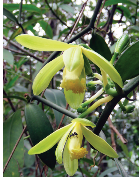
Vanilla denshikoira (Colombia). This species, described in 2018, is known from only two individuals. It is a wild relative of V. planifolia, one of the species used for the production of vanilla. It was discovered in the territory of the indigenous Puinave nation. Members of this nation are among the authors of the paper describing the species, and they chose the name (Denshikoira is a central figure in Puinave mythology)