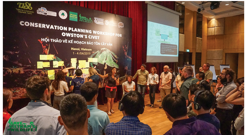
Conservation planning workshop for Owston's Civet, Hanoi, 2019