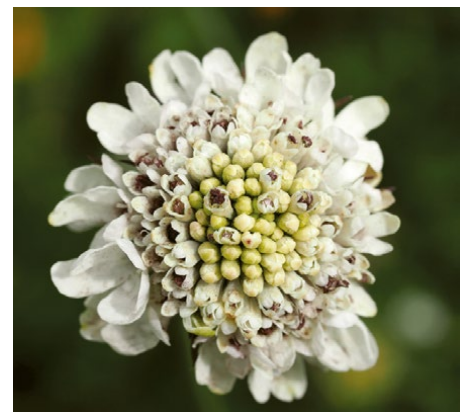
Microbotryum intermedium from Bulgaria