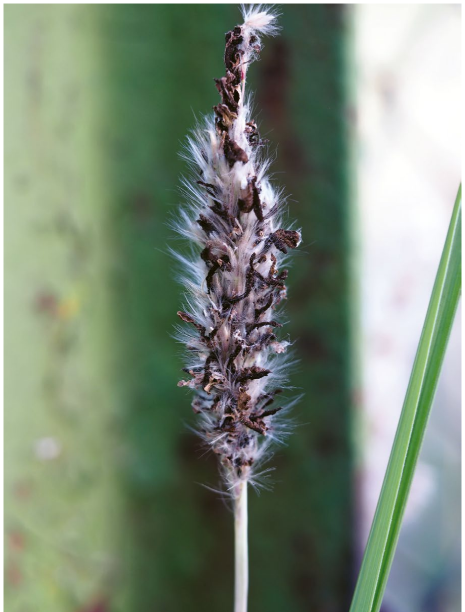
Sporisorium schweinfurthianum (Thüm.) Vánky, Bulgaria