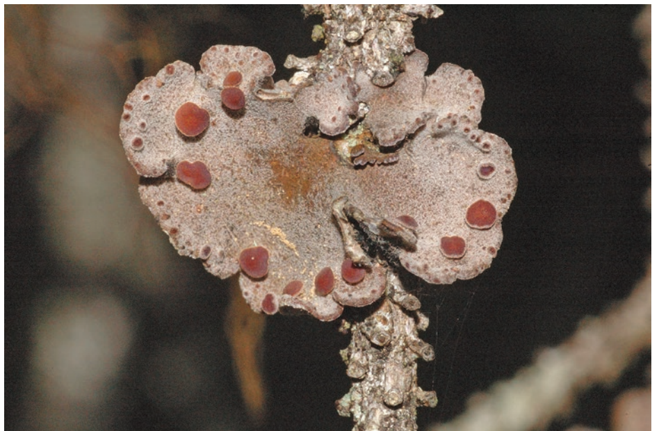
Critically Endangered Erioderma pedicellatum , Alaska