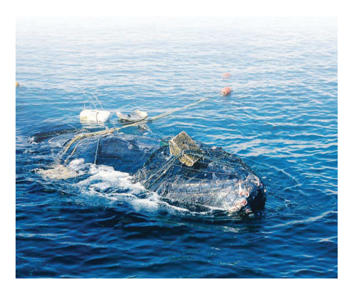
An Endangered Arabian Sea Humpback Whale (Megaptera novaeangliae, Arabian Sea subpopulation), entangled in a fishing net in Oman, Arabian Sea. This individual was released and has been resighted as recently as 2017

network involving nearly 70 scientists and NGOs. The CCAHD has a trilingual website (sousateuszii.org) and held over 20 virtual meetings of working groups to conduct a systematic review of priority actions for conservation of the species. One website, one report and three grants were secured. The report resulting from this review is available for download here: https://www.sousateuszii.org/2021/03/05/ new-report-highlights-priority-actions-for-sousa-teuszii-conservation/. (KSR #26, 27, 43)