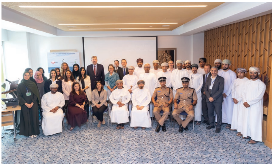
A government and industry stakeholder workshop was held in Oman in November 2022 to discuss conservation management of Endangered Arabian Sea humpback whales ( Megaptera novaeangliae )