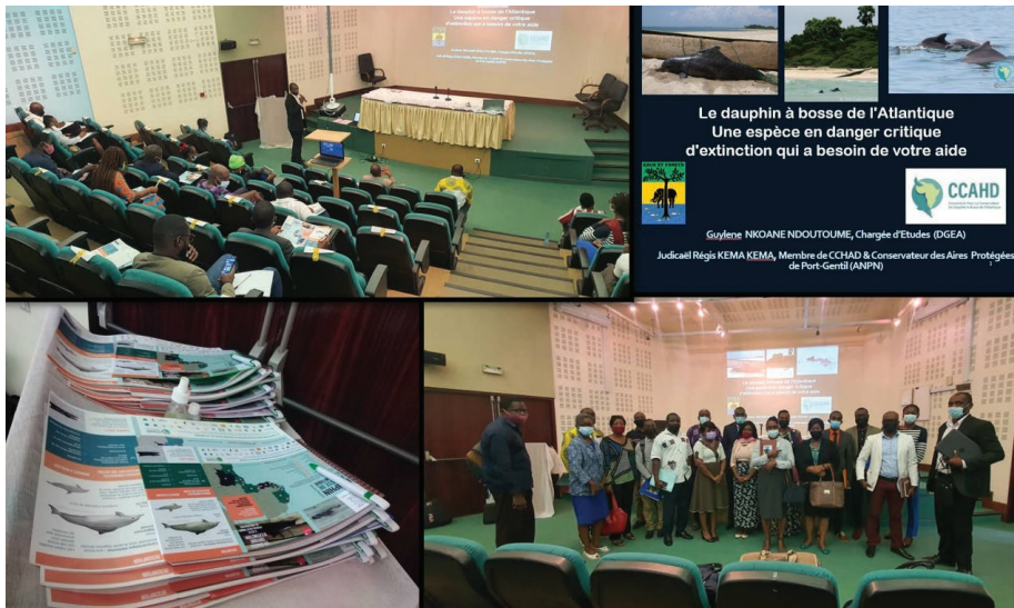
Photos of an IUCN SSC EDGE-grant funded government stakeholder engagement meeting held in Gabon in June 2021. The meeting raised awareness of the conservation needs of Atlantic humpback dolphins and catalysed collaboration between government agencies