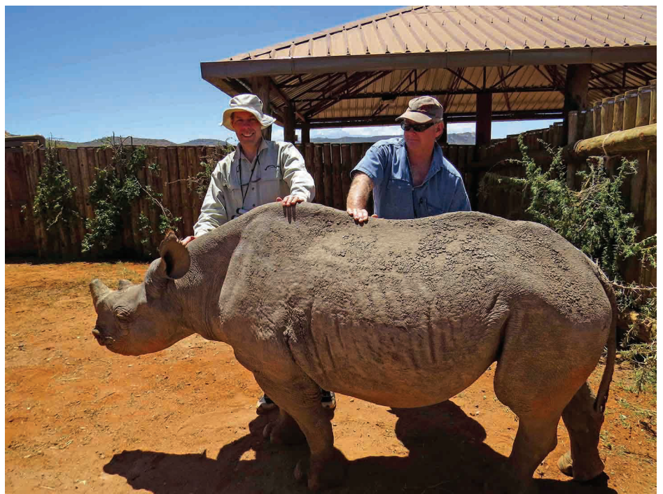
African Rhino Specialist Group SO and Chair with blind Black Rhino in Kenya