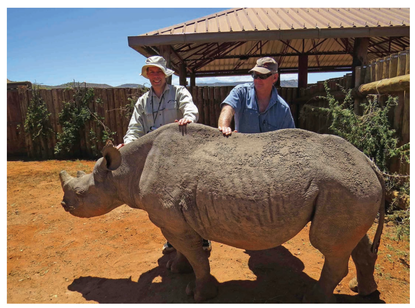
AfRSG SO and Chair with blind BR in Kenya