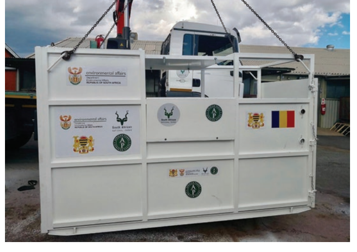
Crate building team