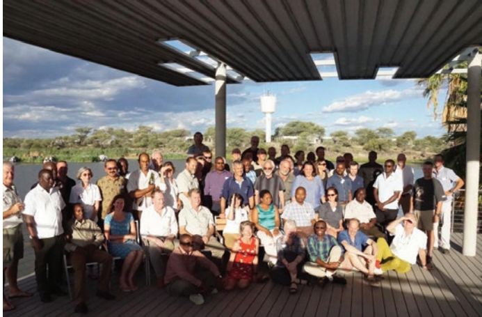
AfRSG members