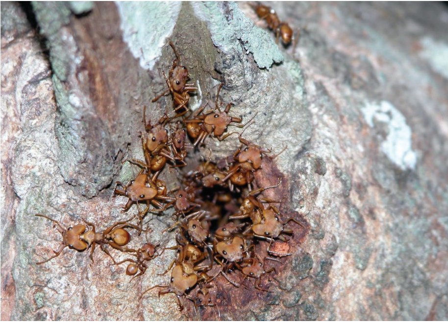
Daceton armigerum , Araguacema, TO, Brazil