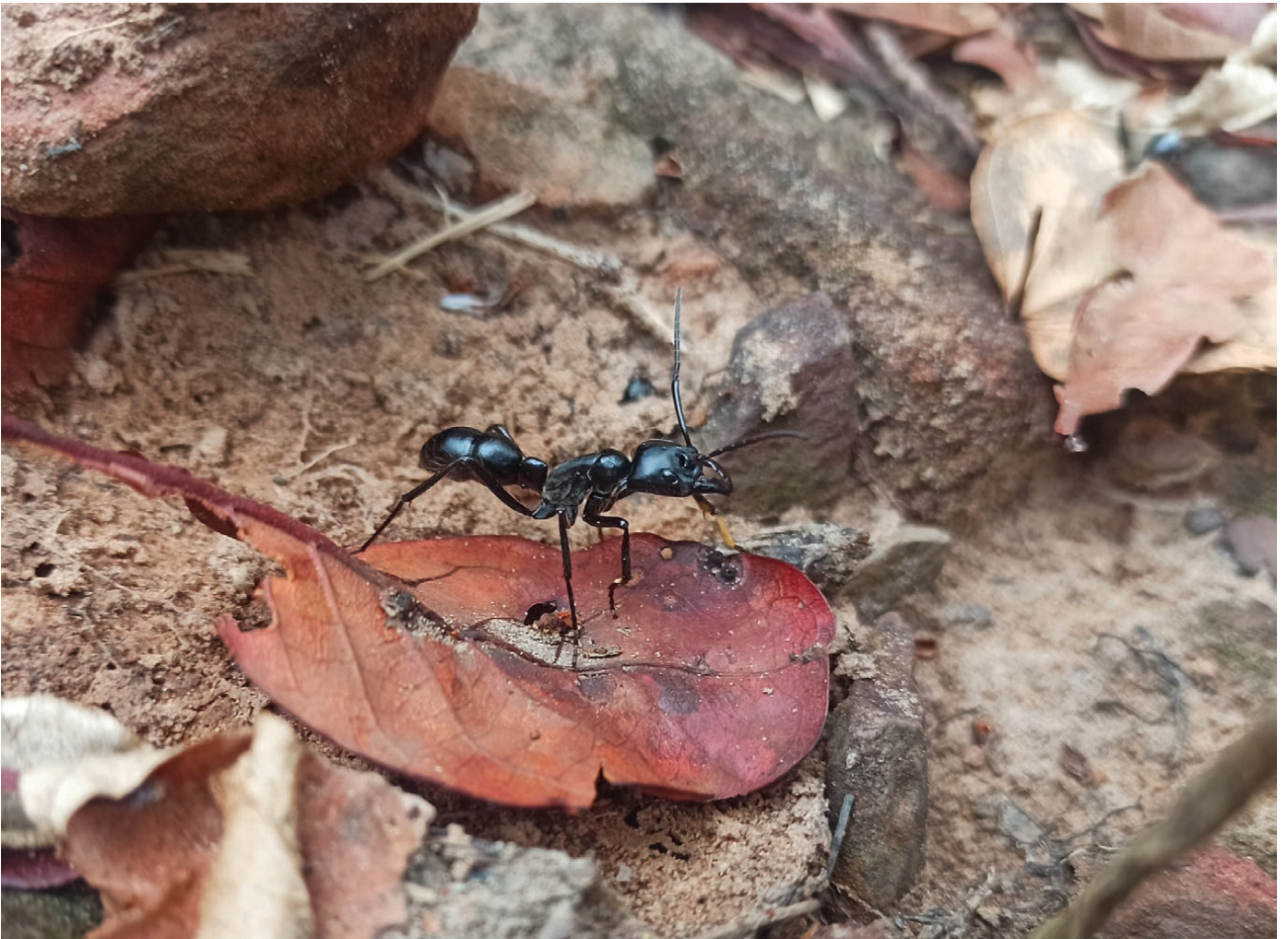
Dinoponera quadricaps, Crateús, CE, Brazil