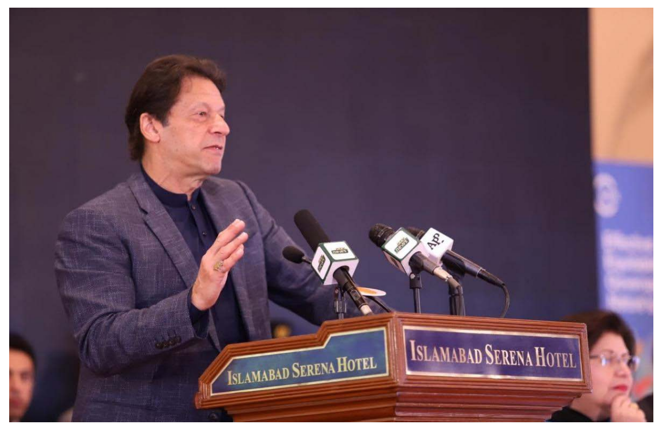
Prime Minister Imran Khan giving his keynote address at the inaugural session of the 7<sup>th</sup> Asia Regional Conservation Forum.

His Excellency commenced his speech by referring to the protection of the environment being a spiritual goal quoting Prophet Mohammed's words that referred to intergenerational equity in terms of need to live presently so that future generations 1,000 years later can live in the same manner. He highlighted the diversity of the country ranging from Himalayan Forests to deserts and tropical areas with the presence of variety of species. The Prime Minister then gave a personal anecdote from 30 years back to emphasise the explosive demographic growth witnessed in the country leading to pressures on the finite natural resources. He spoke of governments previously not being concerned too much about the environment as most decision-makers belong to urban areas and have no direct affinities with rural areas and nature.