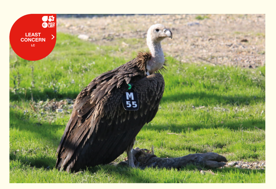
Tracking raptors provides valuable information not only about the species distribution but also about individual mortality and its causes, which is fundamental to design effective conservation actions. Griffon Vulture ( Gyps fulvus ) at the Jbel Moussa Rehabilitation Centre in Morocco.