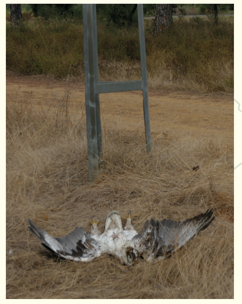
Transport and service corridors coming from impacts of electrocution or collision with power lines is a major threat for 47% of the species assessed. An electrocuted Bonelli's Eagle ( Aquila fasciata) in southern Spain. It is classified as Least Concern in the Mediterranean region.