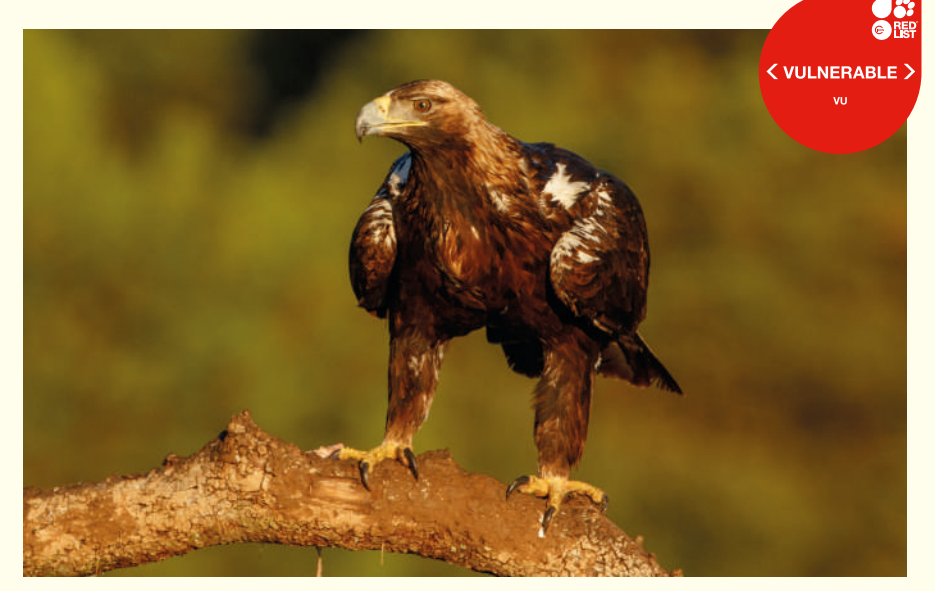
The Spanish Imperial Eagle (Aquila adalberti) is assessed as Vulnerable in the Mediterranean region.

Environmental conditions in the Mediterranean Basin have a profound influence on the vegetation and wildlife of the region. The climate is characterised by hot, dry summers and cool, wet winters, and the topography is varied and contrasting (DG Environment 2022). The Mediterranean region comprises a diverse landscape of high mountains, rocky shores, scrubland, semi-arid steppes, coastal wetlands, sandy beaches and a myriad of islands of various shapes and sizes. The landscape is a direct result of centuries of human-induced activities, such as forest fires, clearance, livestock grazing and cultivation (Zeder, 2008; Sundseth, 2009). The region is one of the world's richest in terms of animal and plant diversity, with a high level of endemism (Myers et al., 2000).