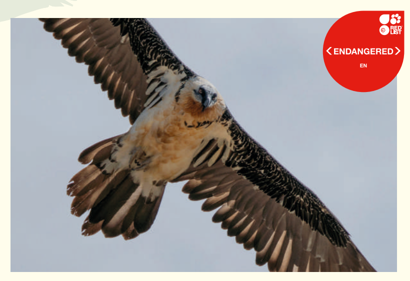
The Bearded Vulture ( Gypaetus barbatus ) is listed as Endangered in the Mediterranean region as a result of habitat loss, direct persecution and poisoning in parts of its range.