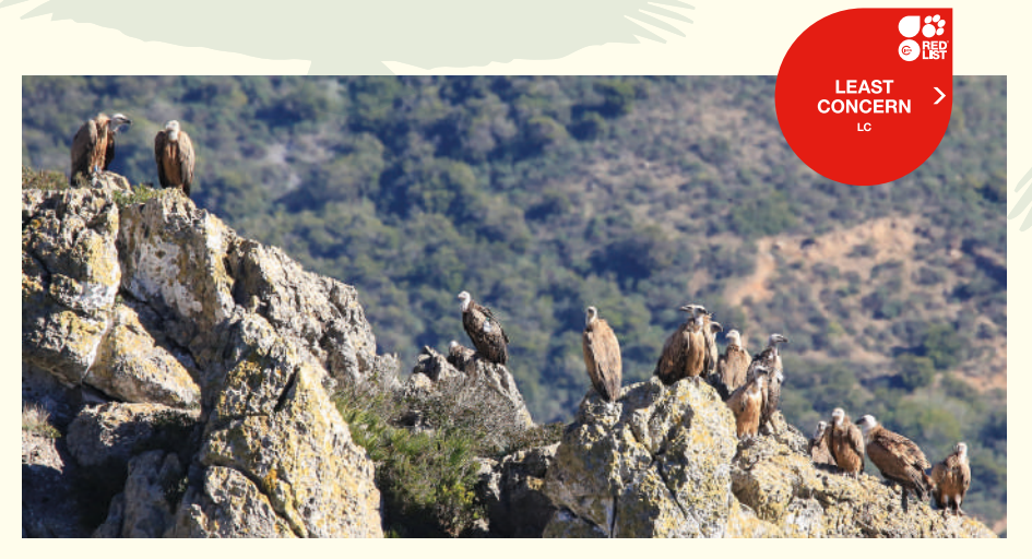
Griffon Vultures (Gyps fulvus) at Jbel Moussa, Morocco.

his report comprises a summary of the regional conservation status of breeding raptors (birds of prey) in the Mediterranean region. The IUCN Centre for Mediterranean Cooperation, in collaboration with BirdLife International, the IUCN Biodiversity Assessment and Knowledge Programme and a key group of regional experts, presents the overall results and findings of the regional Red List assessment. The objective of this report is to provide the baseline status of this group of birds in the region. It summarizes information about those species that have been found to be of greatest conservation concern. It is envisaged that the information contained within this report will facilitate the development of priority research, conservation and management actions for the region.