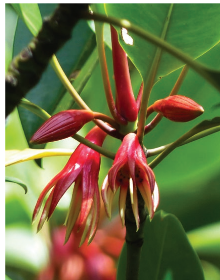
Least Concern Bruguiera gymnorhiza flowers, Merbok, Malaysia