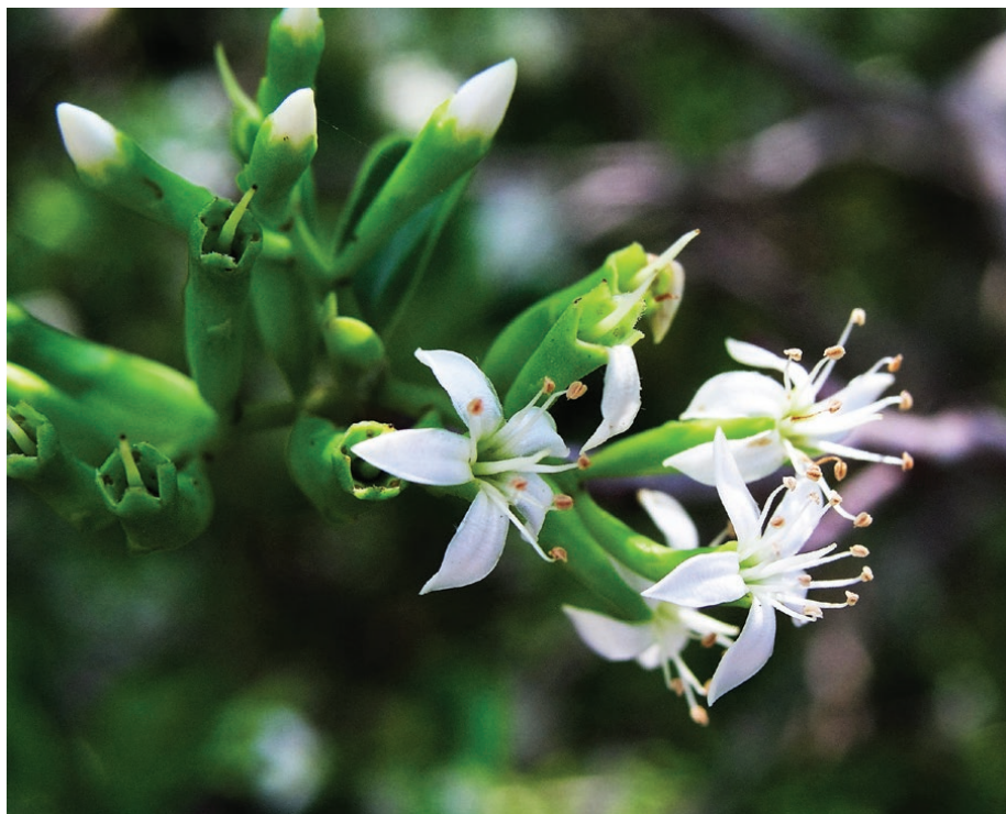
Lumnitera racemosa flowers, Bali, Indonesia