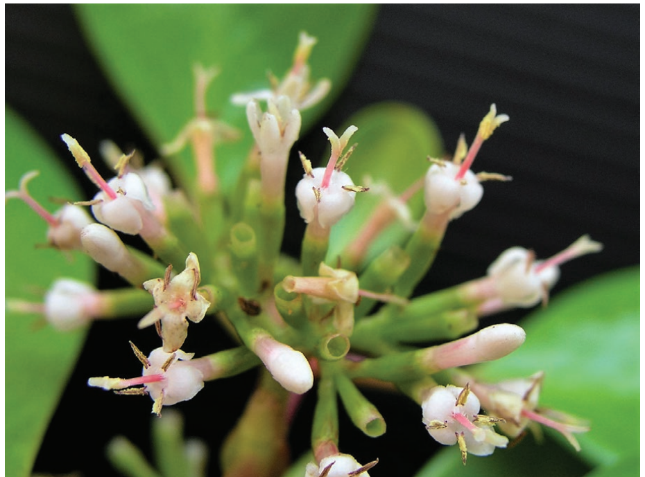
Least Concern Scyphiphora hydrophyllacea flowers, Pulau Ubin, Singapore

T-002 Participate in the Red List of Ecosystems.