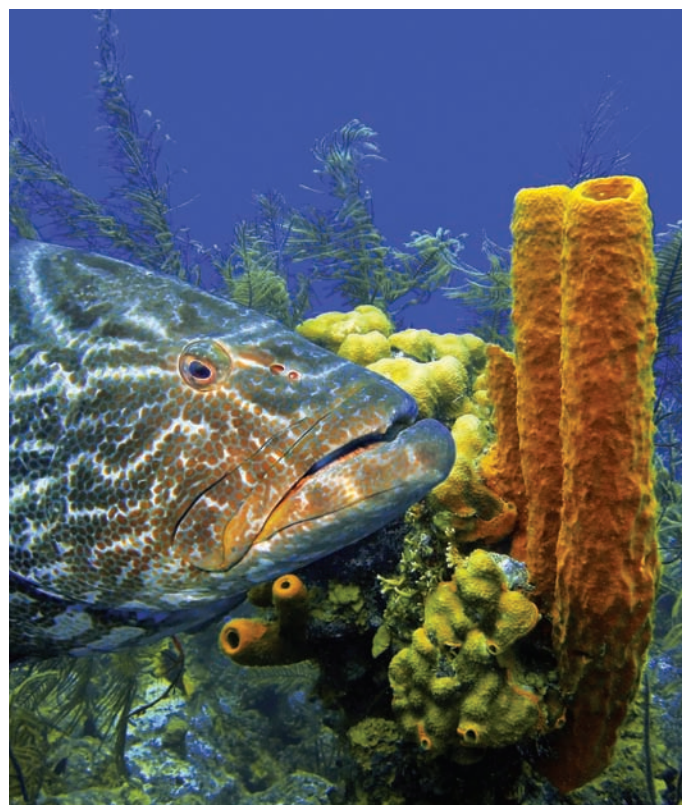
Marine protected areas conserve and restock fisheries, critical resources for coastal communities.

Implications: Protected area specialists need to work more closely with relevant national and local level governments and technical agencies responsible for managing ecosystem services such as water supplies, coastal protection, flood control etc. In some cases, investments in restoring ecosystems within, and adjacent to, protected areas may be more cost-effective than investing in hard infrastructure alone.