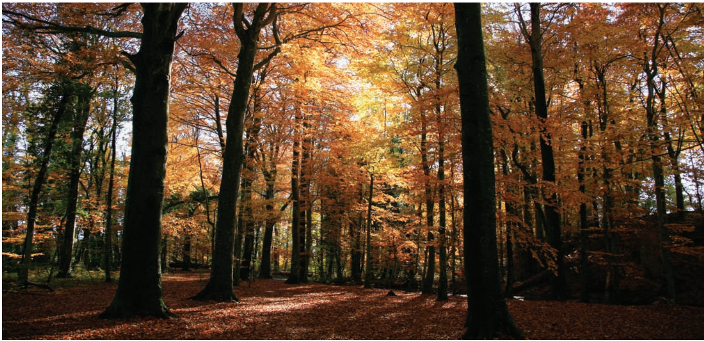
Forests cover about 30% of total land area but store some 50% of terrestrial carbon.

wetlands, tropical and temperate grasslands and coastal habitats such as mangroves and sea grass beds. They are the most effective management strategy known to avoid conversion to other land uses and loss of carbon and to secure carbon in natural ecosystems. Data from the UNEP-World Conservation Monitoring Centre indicates that there are already 312 GtC stored in the global protected area network, an estimated 15% of the world's terrestrial carbon stock. Tropical protected areas, especially those established and managed by indigenous people, lose less forest than other management systems. As protected area coverage increases there are opportunities to protect additional "high carbon" ecosystems and to manage, and in some cases restore, habitats such as peat lands, for carbon retention.