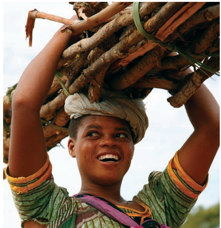
Protected areas help to reduce the impacts of climate change on vulnerable communities.

Protected areas are efficient and cost effective tools for ecosystem management, with associated laws and policies, management and governance institutions. Increased coverage and connectivity at the landscape level and more effective management will enhance the resilience of ecosystems to