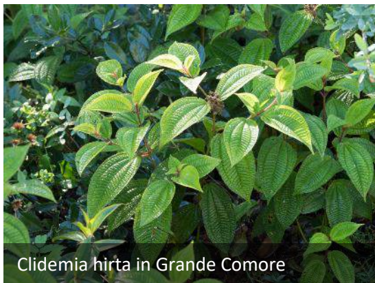
Clidemia hirta in Grande Comore