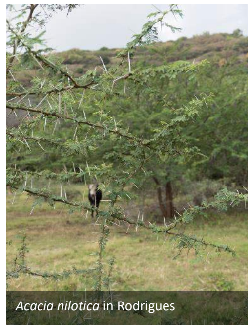
Acacia nilotica in Rodrigues