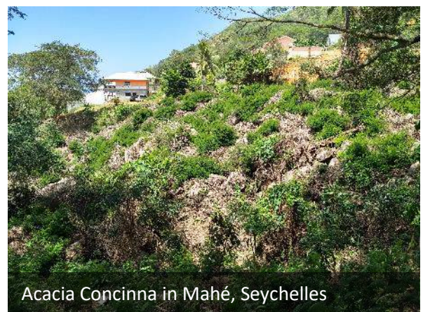
Acacia Concinna in Mahé, Seychelles