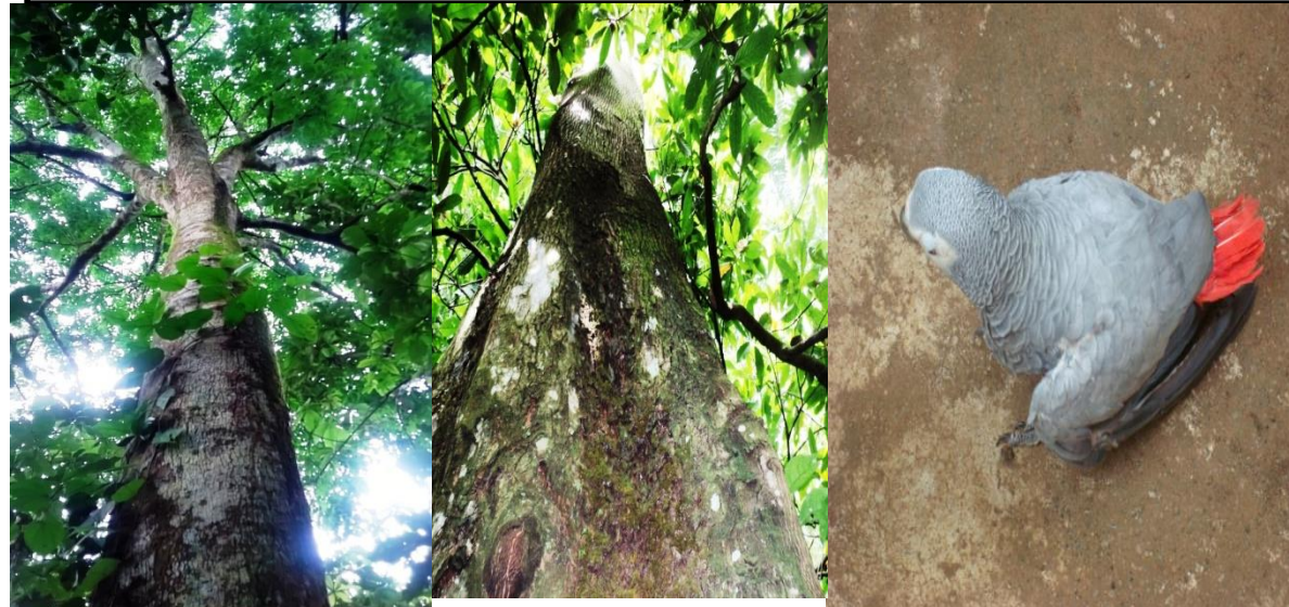
Fig. 2: a) Okoubaka (b) Tieghemelia (c) African Grey parrot

African Grey Parrot , Black-and-White-Tailed Hornbill , Brush tailed Porcupine , Nile crocodile , Eagle , Piping Horn Bill , Snails , etc.