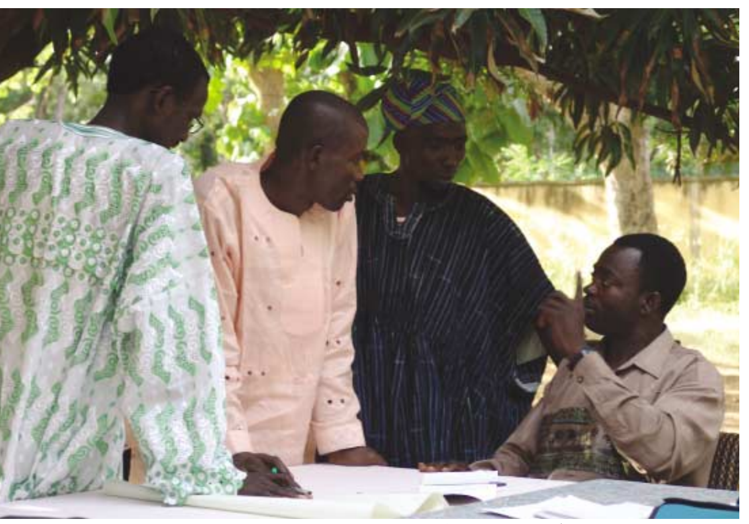
Discussion on transboundary issues at PAGEV meeting in Burkina Faso

IUCN collaborates with international organizations and other policy and research institutes. By leading global and supporting regional policy campaigns, and building coalitions, it strives to support sustainable water resources investment strategies of multilateral agencies and financial institutions. It engages in global water, development and environment policy and network mechanisms, such as the Ramsar Convention, the World Water Council, Global Water Partnership and UN Water, in collaboration with commissions and members. IUCN holds observer status at the United Nations which enables it to actively participate in the UN system to promote sustainable water use.