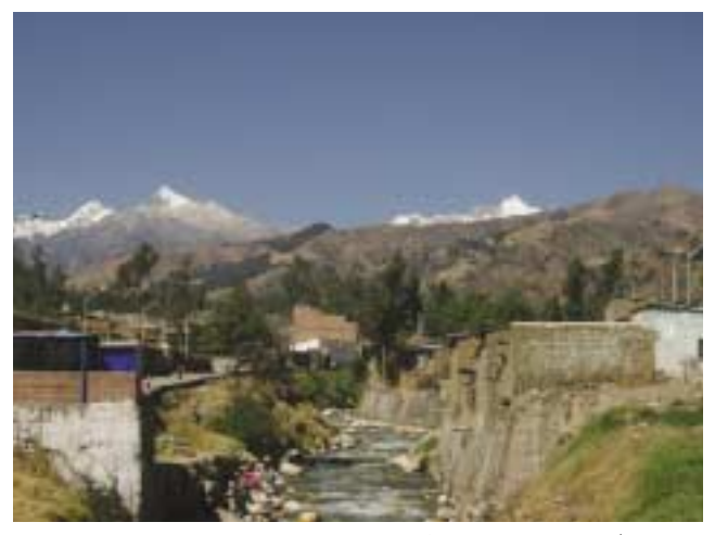
Stream in the Huascarán area

Working through a network of members and partners, IUCN in South America raises awareness on the role of ecosystems in water supply. This includes development of strategies for local communities, municipalities and the national government to adapt to the changing water regimes in the Andes. Mountain ecosystems form part of the infrastructure needed to provide the rich and the poor with safe and reliable water. It is only through a coordinated effort at local, provincial, national and regional levels that progress can be made towards water security in South America.