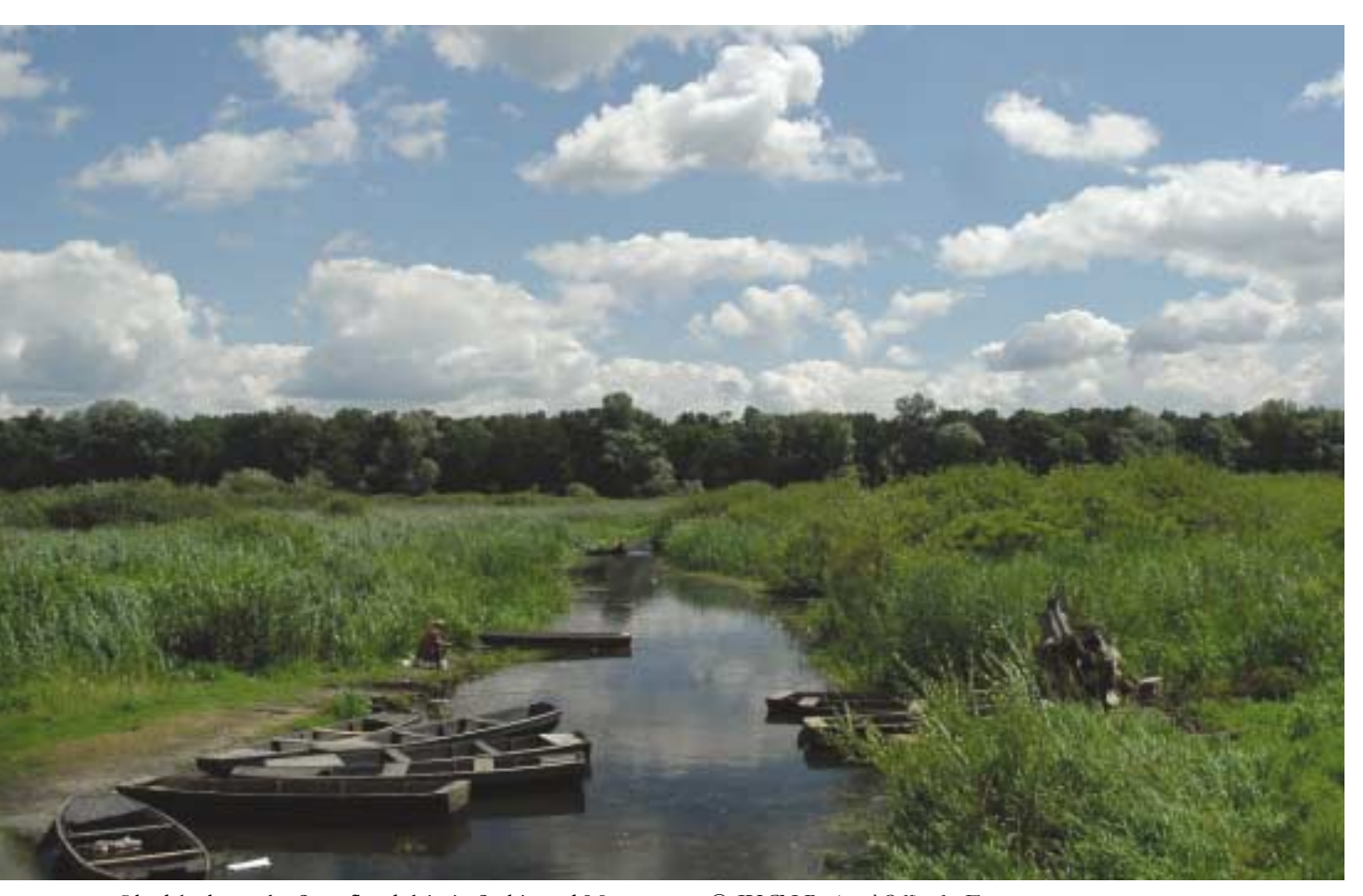
Obedska bara, the Sava floodplain in Serbia and Montenegro