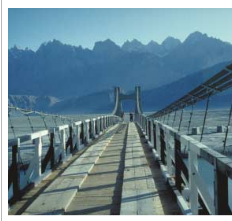
A new bridge across a river linking two regions in Shyok valley, Pakistan

IUCN's work in the Himalayan Region started in 2006, and aims to mainstream the approaches to ecosystems and sustainable livelihoods via work featuring transboundary learning, sharing and demonstration. Partners from Pakistan, India, Nepal, Bangladesh, China and Bhutan are engaging in this collaborative, regional effort.