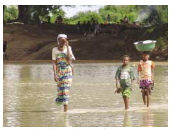
Crossing the Volta River between Ghana and Burkina Faso

Coordinating water use across boundaries