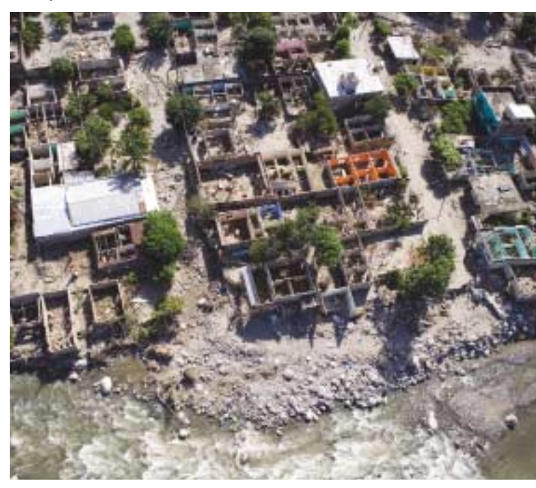
Aftermath of Hurricane Stan

Battling the storm – and restoring water supplies and ecosystems