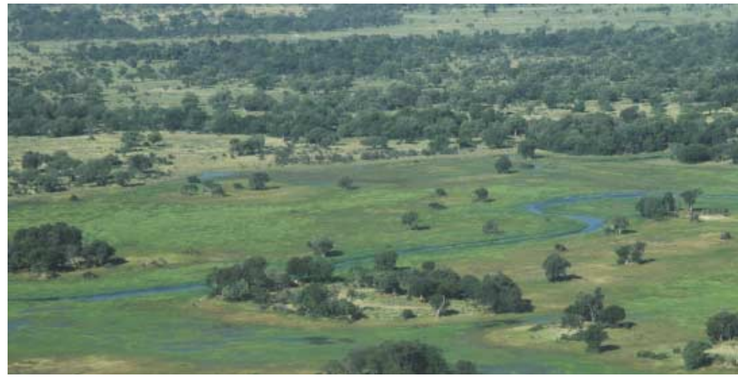
View of Okavango river basin