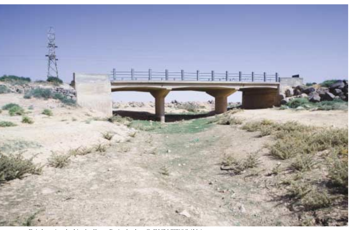
Dried up river bed in the Zarqa Basin, Jordan