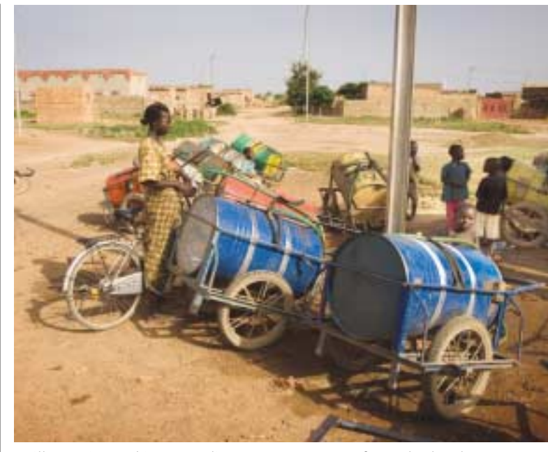
Villagers in Burkina Faso line up to get water from the local well, which they all contribute money for maintenance.

IUCN headquarters works closely with regional programmes in developing and implementing water, river basin and wetland activities. Central to its role is linking practice, instruments and policy. It strongly supports the work in demonstration sites and oversees the development of toolkits. It supports the development of regional water policy campaigns and leads on global water policy campaigns.