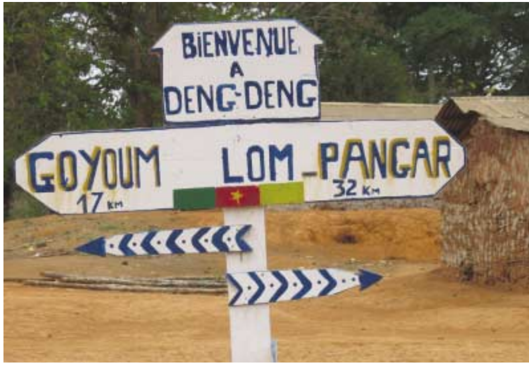
The village of Deng Deng will be the most affected by the construction of the dam. It is situated only 32 km from the future site.

During the planning process of this project, an Environmental Impact Assessment (EIA) was carried out by ISL, Oréade-Breach and Sogreah. All parties involved requested an independent group of experts to be established to ensure a high quality EIA could be delivered. Following a request from the government of Cameroon (an IUCN member), IUCN facilitated the establishment of an EIA expert review team between August 2003 and October 2005. IUCN further supported the EIA process by ensuring transparency in communication was maintained to avoid misunderstandings between all stakeholders.