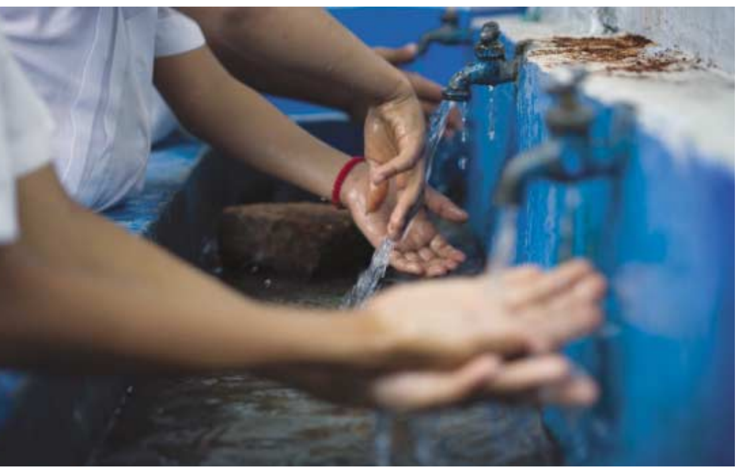
School children washing their hands.