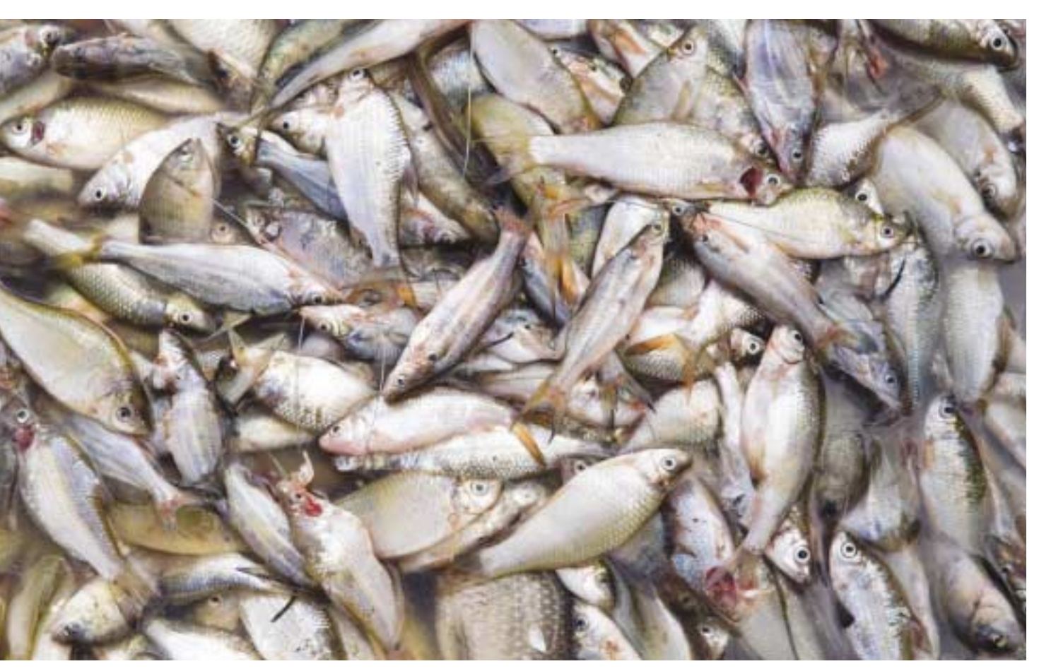
Freshly caught fish in Vietnam