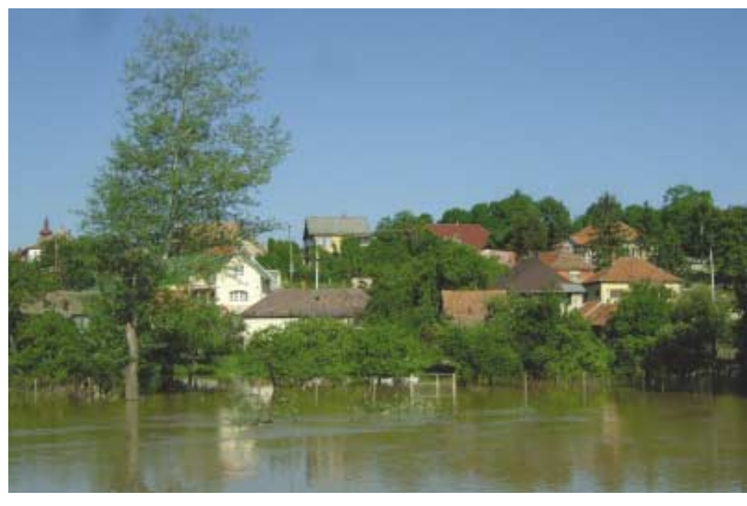
Village along the banks of the Tisza

IUCN is working with its commissions and the project partners to develop a rapid appraisal approach for trends in basin development driving forces. It further focuses on the development of new methods for defining and managing the buffer and storage capacity of river basins. IUCN is also establishing networks of experts and practitioners to support application of new water management tools such as Flow, Value and Pay in selected river basins.