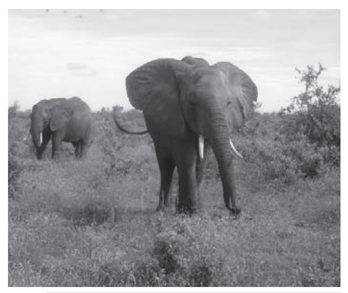
Picture 1. The African elephant ( Loxodonta africana )

In Southern Africa, climate change is dispensing drought and flood simultaneously. The region depends on a weather pattern known as the Intertropical Convergence Zones under which moist air from the Indian Ocean travels southwest towards the Cape of Good Hope and then returns. Until recently, rain fell in the Zambezi basin over a five-month season, from October-November to March-April. Lately, the Convergence Zone has been arriving late and leaving early. The wet season has shrunk to four months and is heading towards a mere three months. Nonetheless, annual total precipitation— while varying more and more— appears likely to decline by only 10 to 20 per cent.<sup>4</sup> That degree of continuity gives less solace than one might think. Compressed into a shorter interval, this rainfall should contribute to increasingly severe storms and floods. In short, the agroecology of the Zambezi basin is changing dramatically and disastrously.