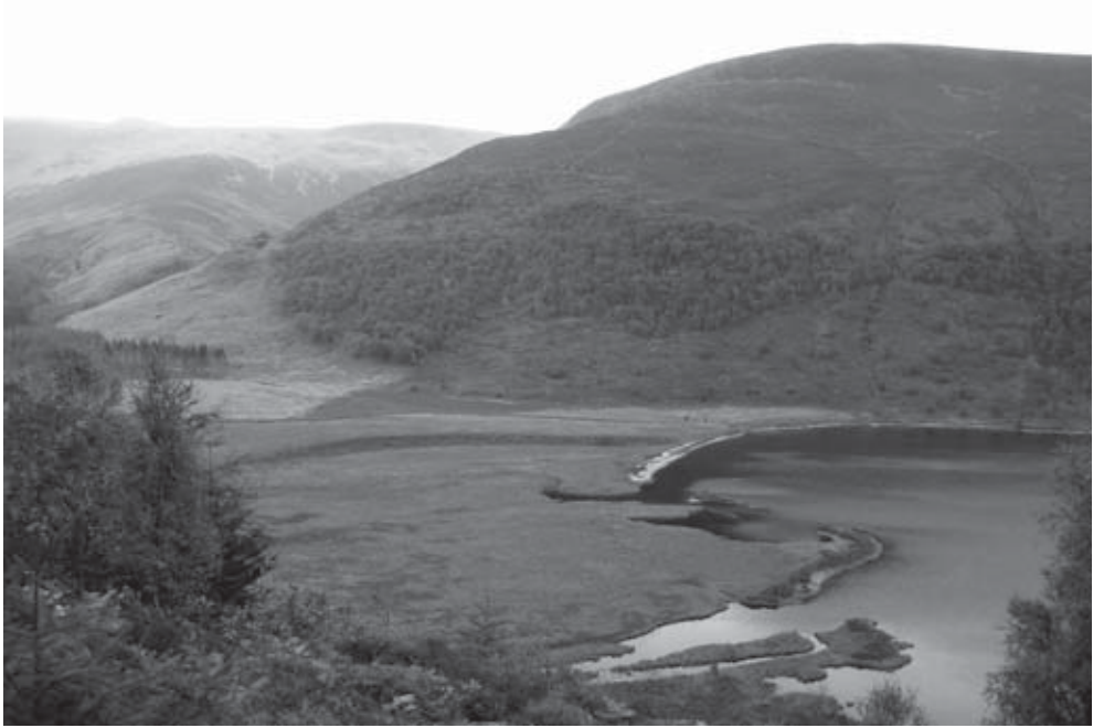
Picture 2. Ennerdale, Lake District National Park, England

This vision would help to re-establish a role for national parks within the UK in future. First and foremost, they would supply ecosystem services to the country. But also, as places that are