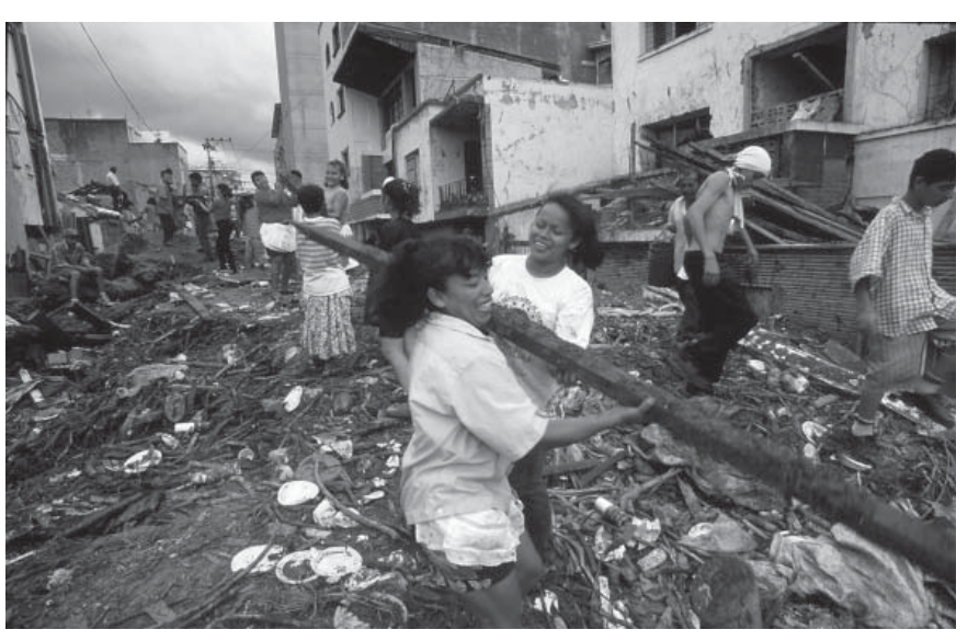
Picture 2. Landslide which left 3000 homeless, West Papua, Indonesia (former Irian Jaya)

Protected areas can provide barriers against the impacts of drought and desertification by reducing pressure, particularly grazing pressure on land and thus reducing desert formation. Protected areas also maintain populations of drought resistant plants to serve as emergency food during drought or for restoration. The role of protection strategies in providing insurance against drought has been utilised for centuries and, for example, is the basis of the hima system that set aside land to protect grazing in the Arabian Peninsula and was formalised under Islam.<sup>34</sup> Today, there