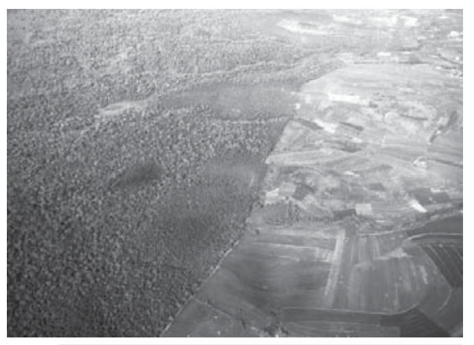
Picture 2. Deforestation to the edge of Ngorongoro Conservation Area, Tanzania

climate control. Economists usually require two conditions to achieve such equilibrium: low transaction costs and secure property rights. Considering a global emission baseline instead of national baselines would enable low transaction costs, while securing the use rights of indigenous people, who are, in most cases, the direct users of forest resources, would be part of an answer to the second condition.