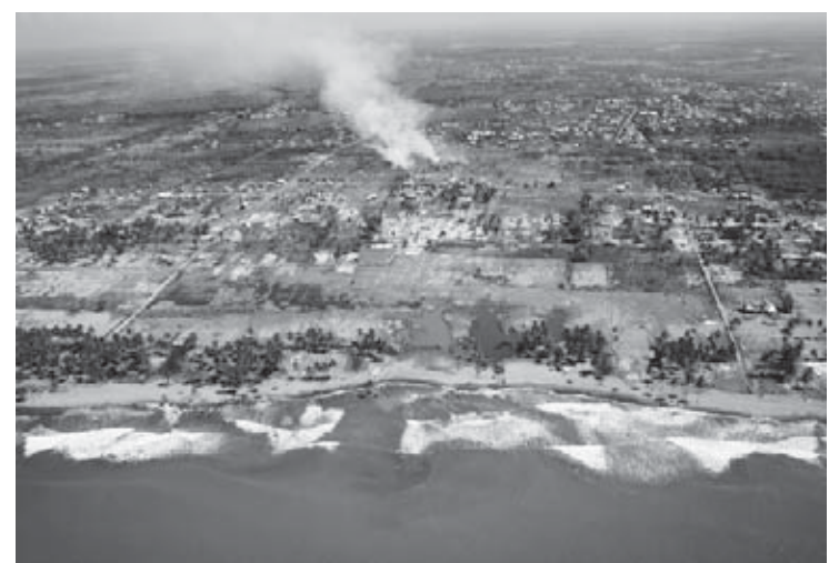
Picture 3. Devastated coastal area in Aceh province of Indonesia after the 2004 tsunami

elements ( e.g. , includes leaving forests to attain old-growth characteristics and support deadwood species) and managing to reduce fire risk. In countries like Australia protected area managers often use prescribed fire in protected areas to reduce threats of large-scale fires developing and moving out into surrounding farmland and settlements.