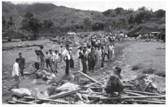
Picture 1. People picking up remains of houses after hurricane Mitch Tegucigalpa, Honduras

have contributed to a significant rise in the number of floods and major wild fires on all continents since the 1940s ".<sup>13</sup> The Intergovernmental Panel on Climate Change has similarly noted that: "The resilience of many ecosystems is likely to be exceeded this century by an unprecedented combination of climate change, associated disturbances (e.g., flooding, drought, wildfire, insects, ocean acidification), and other global change drivers (e.g., land use change, pollution, over-exploitation of resources)".14