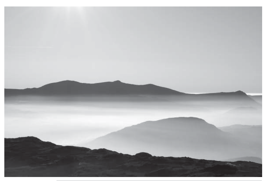
Picture 1. Snowdonia National Park, Wales

There are of course many uncertainties in trying to understand the likely impact of climate change on the National Parks, both because it is not yet possible to predict future climate with complete confidence and because assumptions have to be made