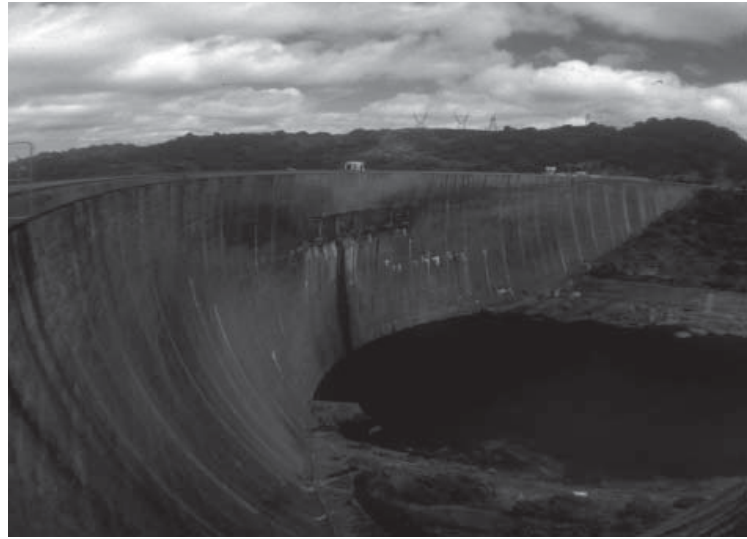
Picture 2. Kariba Dam, viewed from the downstream side

Less hypothetically, policy-makers would like to invest in carbon-friendly sources of energy. The Zambezi countries have advanced farther along this path than most— far enough to imperil their protected areas. Gorges and gradients give the river enormous potential for hydropower. To the frustration of the Zambezi River Authority— the engineering body in charge of hydropower - only Kariba, Cahora Bassa, and small station at Victoria Fallscurrently draw power from the river. For economic rather than ecological reasons, the Authority has long hoped to insert more impoundments upstream and downstream. Indeed, its grandest design would leave scarcely a kilometre of wild river between Victoria Falls and Tete, in central Mozambique. More modestly, in the 1980s, the Authority proposed two dams, both of which alarmed conservationists in the region. Most Zimbabwean organisations eventually accepted the Batoka Gorge Dam: a run-of-river barrage that would have filled a narrow, mostly unvegetated chasm upstream of Kariba. The second proposal— for a Mupata Gorge