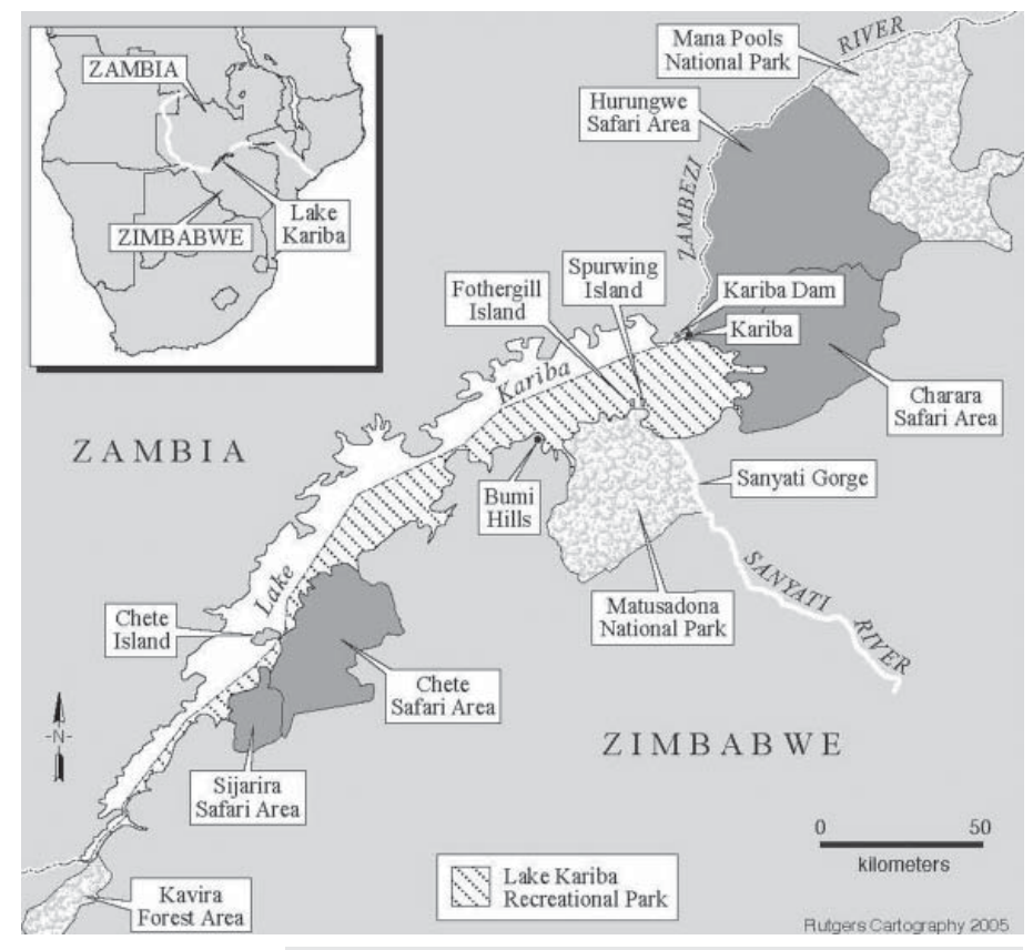
Figure 1. Map of the Zambezi Valley

ists have mostly opposed them. Will the urgent need for sustainable energy change their minds? Perhaps it will, and conditions may require a further sacrifice: of the tourism industry. Possibly the world's least sustainable sector,