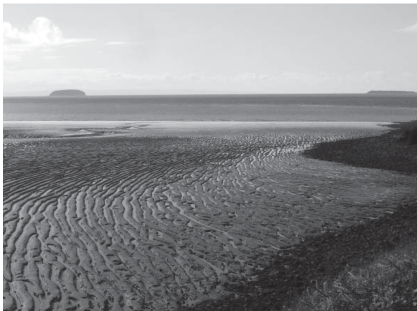
Picture 1. The Severn Estuary between England and Wales, UK

Abstract. The modern environmental movement has been highly influenced by concerns about energy supplies and the need for a coherent energy policy. However, consensus amongst NGOs has recently disappeared and it is possible to find mainstream environmental groups opposed to every realistic energy source. This creates strategic dangers and weakens the environmental position in future debates about energy supply. The article argues for the development of a strategy and an NGO agreement.