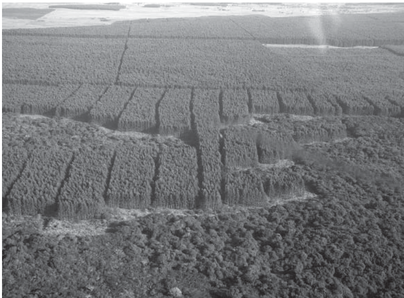
Picture 2. Eucalypt plantations in South Africa

This will not be easy. There are very few totally "clean" supplies, so that support for one over another will be a matter of careful judgement and some trade-offs.