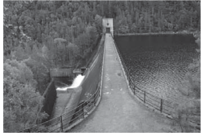
Picture 1. Scotland already derives much of its electricity supply from hydro sources

It is also important to gather objective information on the source of energy raw materials used, including the type of energy material, and its geographical provenance, and on the technology used, including its reliability to transform it into consumable energy.