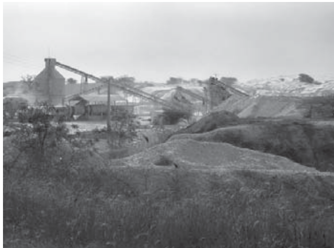
Picture 2. Quarry in a forest reserve in Senegal

and flows, where only the non-use will allow the maintenance of existing stocks. The contemporary approach to conservation— which focuses on the preservation of the regenerative capacities of natural ecosystems and the sustainable use of living resources— 17 corresponds to applying to biotic resources an approach that is adapted to their specific characteristics, i.e. specified in terms of environmental funds and multifunctional services. The new concept is thus a progress. At least the days are gone when scientists and politicians from industrial countries, living mainly from mineral resources (and therefore more easily able to protect their own biotic resources), directed people living mainly from biotic resources not to use their only available resources.