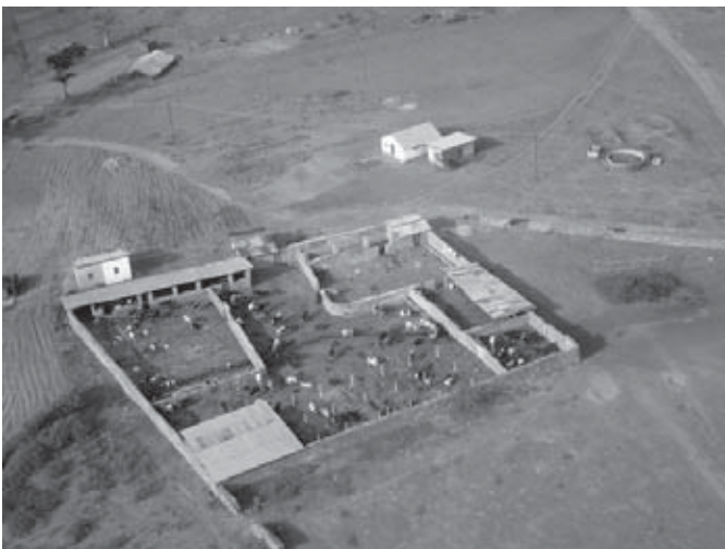
Picture 1. The prospect of drought and increasing food shortages are real threats in many developing countries

The struggle to keep up with energy demands, particularly from rapidly developing countries like India and China, is driving more and more companies