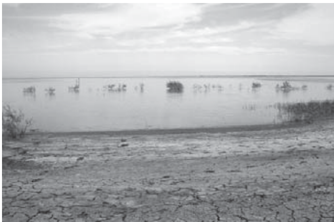
Picture 2. West African marine environments could be at risk from increased oil and gas production

In recognition of the severe problems arising from the oil and gas industry, and the finite nature of these resources, calls for an Energy Revolution on