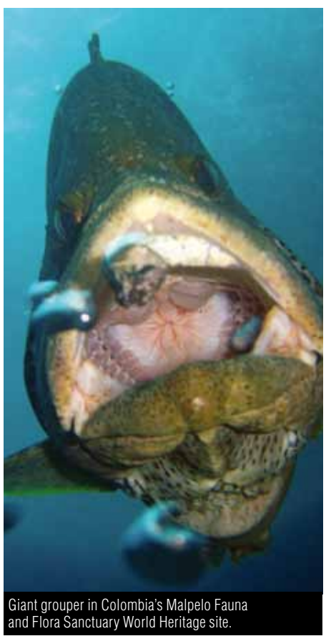
Cesar Alejandro Uribe Tovar -CAUT- & Miguel Angel Ruiz Diaz

sites for their marine values. Among these new biodiversity treasures is The Wadden Sea in the southern North Sea, where over 10 million birds stop over every year on their way from their breeding areas in Siberia, Canada or Scandinavia to their wintering grounds in Western Europe and Africa. The Wadden Sea acts as a crucial staging post for many species, providing them with enough food to complete their long journey. The site is jointly managed by Germany and the Netherlands. In 2005 and 2006 respectively, Panama's Coiba National Park and its Special Zone of Marine Protection, in which 80 per cent of the fish species are unique to the area; and Colombia's Malpelo Fauna and Flora Sanctuary, a site vital for the replenishment of sharks, giant grouper and billfish in the Eastern Tropical Pacific, were inscribed on the World Heritage List. Together with the