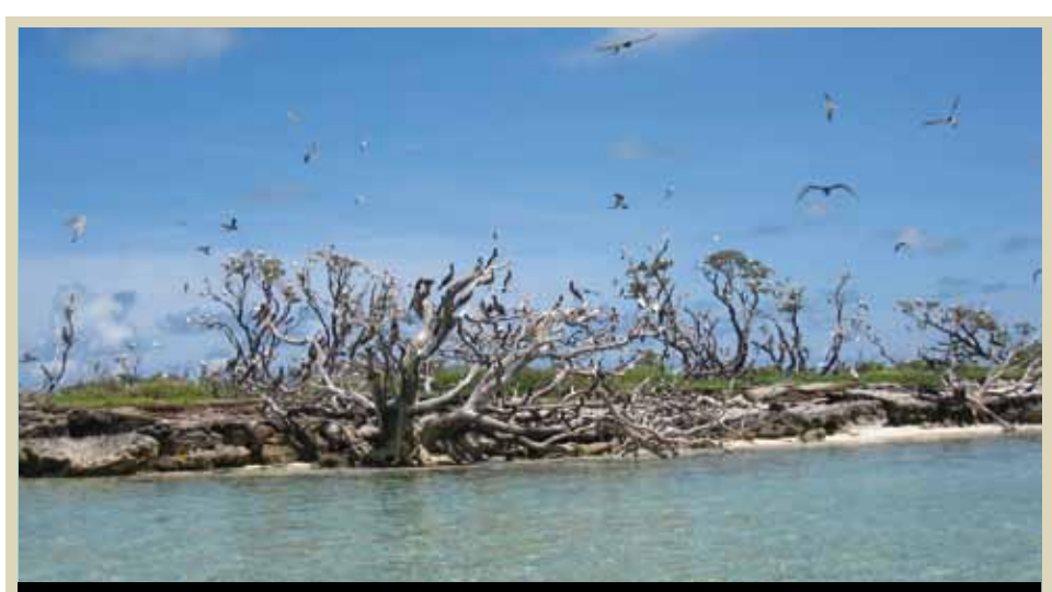
Tubbataha Reefs Natural Park (Philippines), inscribed on the World Heritage List since 1993.