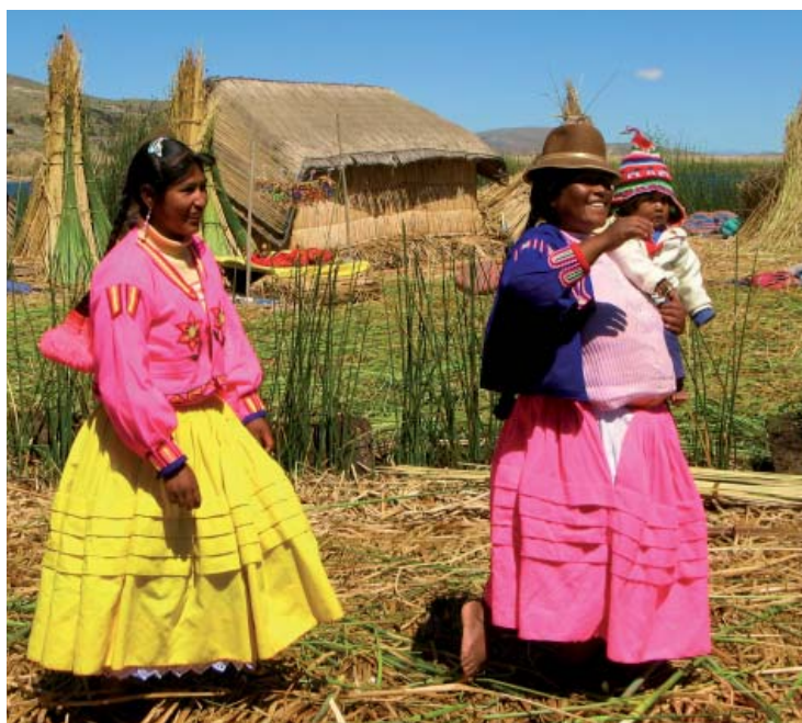
Women from the Uros people on their reed islands on Lake Titicaca