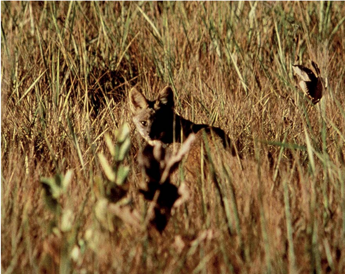
Wolf in Emas National Park, Brazil

WCPA created the Grasslands Protected Area Task Force in 1996 to raise the level of protection for grassland ecosystems, placing immediate priority on temperate grasslands. Temperate grasslands are one of the most altered ecosystems on the planet. They have been changed so much by human activity, mostly food production, that little remains today in a natural state. Wildlife in tremendous numbers once called these grasslands home but in most cases only remnants survive. In the decade since the creation of the Task Force, there has been a significant rise in the level of interest in the conservation and protection of grasslands. In 2008, the Temperate Grasslands Conservation Initiative was launched, with a focus on communication and cooperation at the global level to increase their protection and sustainable use and to reverse biodiversity loss.