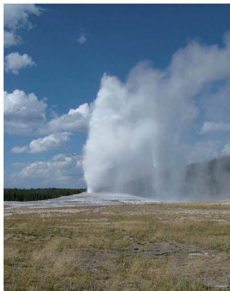
Yellowstone National Park

The 1972 conference marked the centenary of the founding of the first modern national park at Yellowstone, USA—and fittingly was held at that park and at nearby Grand Teton national park. The event however was strongly forward looking. A primary example is the work begun at the 1972 conference on developing a system for categorizing protected areas (see Chapter IV). This sought to address the prevailing confusion over the meaning of terms such as “national park” and “nature reserve”. At a time when many more protected areas were being set up, ambiguity over the purposes for which areas were managed, and inconsistency in terminology hindered efforts to protect these places, to collect and analyze information about them, and to provide the scientific community access to better data on conservation. The Commission also helped to raise the profile of issues such as management effectiveness and financial support for protected areas. Commission Chair Jean-Paul Harroy compiled and published “World National Parks—Progress and Opportunities”. In this respect too, the 1972 conference was a landmark: it consolidated world wide experience in park policies and management approaches, and marked a shift towards a more professional form of management.