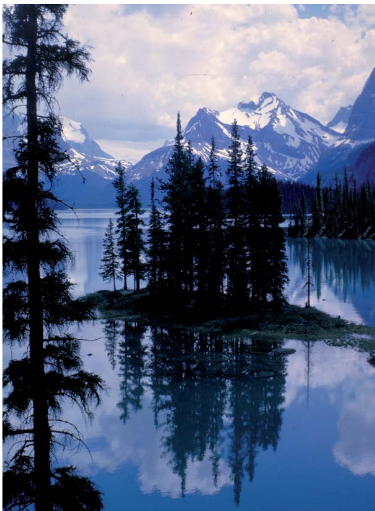
Maligne Lake in Jasper National Park, Canadian Rockies