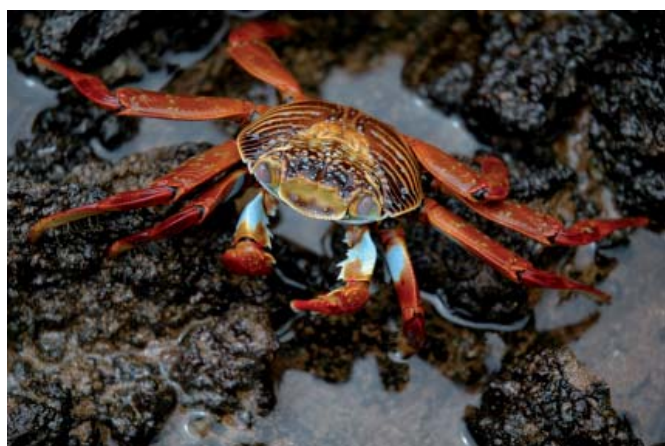
A Sally lightfoot crab on Bartolome Island, Galapagos, Ecuador

Milestone opportunities to review progress and set new agendas have occurred at World Parks Congresses, numerous regional conferences and the First International Marine Protected Area Congress in Australia in 2005. WCPA has worked to ensure continuity between major meetings, helped to plan new events, and advocated for a focus on marine protected areas in key conservation events. Globally agreed goals for 2012 include the establishment of a global network of marine protected areas, and WCPA has strengthened its marine membership and enhanced global and regional communication systems in anticipation of the increasing scale and pace of action to meet these goals.