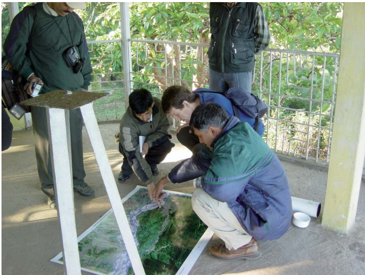
Kaziranga National Park, Assam, India

In 2008, the World Database on Protected Areas (WDPA) was re-launched online following a complete redevelopment of the database and the incorporation of maps and visualization tools. It is the most comprehensive global data set on marine and terrestrial protected areas available, providing information on more than 120,000 national and international protected areas. Increasingly, the WDPA also holds information on private, community and co-managed reserves. In addition to use by protected areas professionals, it is an important resource for scientists, managers and policymakers for tracking progress towards the United Nations Millennium Development Goals. The WDPA is a joint project of UNEP and IUCN, produced by the UNEP World Conservation Monitoring Centre (UNEP–WCMC) and the IUCN World Commission on Protected Areas, working with governments and NGOs.