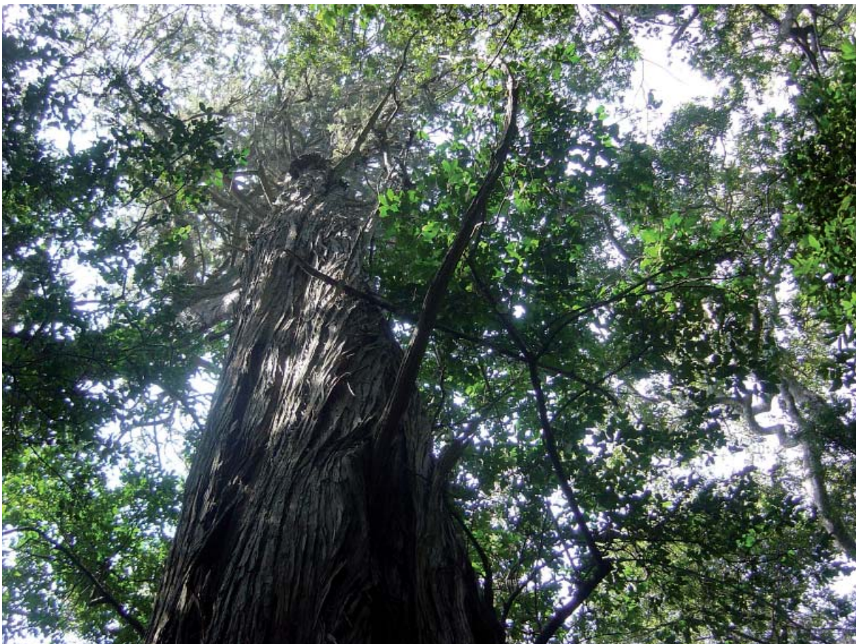
Ancient Juniper, Nyika National Park, Malawi