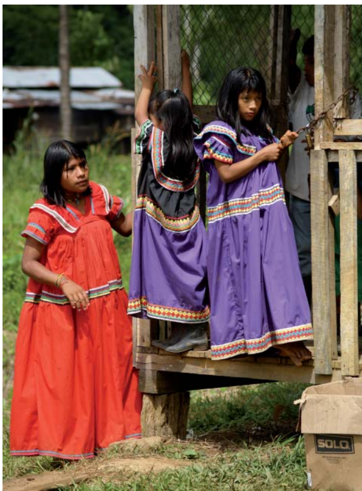
Children in Coto Brus Anthropological reserve, Costa Rica