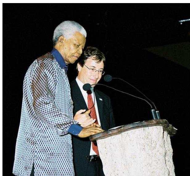
Nelson Mandela, WPC 5 Congress Patron and Achim Steiner, IUCN Director General, 5th IUCN World Parks Congress, Durban South Africa

Nearly 3,000 participants from 160 countries attended the Congress. WCPA took the lead in planning and organizing the event with the cooperation of many governments, working closely with the IUCN Programme on Protected Areas. The Durban Action Plan spelled out some major challenges for the Commission and all of its associates for the years to come. The Congress was critical in preparing the ground for the adoption (a year later) of a work programme on protected areas by the Conference of the Parties of the Convention on Biological Diversity (CBD). The Parks Congress also pressed for all sites whose biodiversity values are of "outstanding universal value" to be inscribed on the World Heritage List.