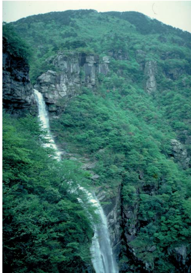
Lushan National Park, China

The IUCN General Assembly approved the new system in 1994, commended it to governments and asked the Commission to help explain it. Guidelines were published, with an introduction by WCPA Chair Bing Lucas. “These guidelines have a special significance as they are intended for everyone involved in protected areas, providing a common language by which managers, planners, researchers, politicians and citizens groups in all countries can exchange information and views,” he wrote.