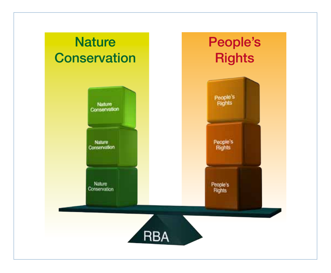
Figure 1: Visual Representation of an RBA to Conservation Objective

The concept of developing and applying a rights-based approach (RBA) to nature conservation could be perceived as such an instrument. The objective of an RBA to conservation is to harmonize nature conservation activities with respect for people's rights (in particular, human rights).