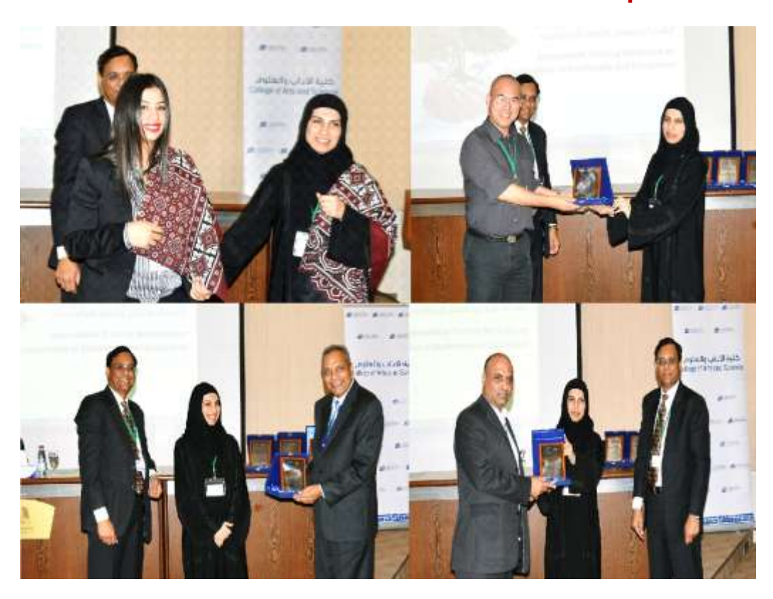
Souvenir Distribution to Workshop Resource Persons.