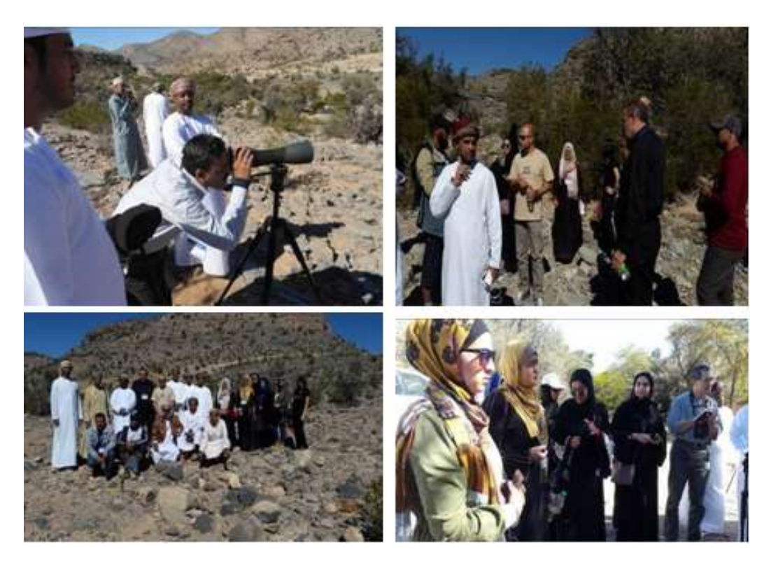
Field work during the Workshop.