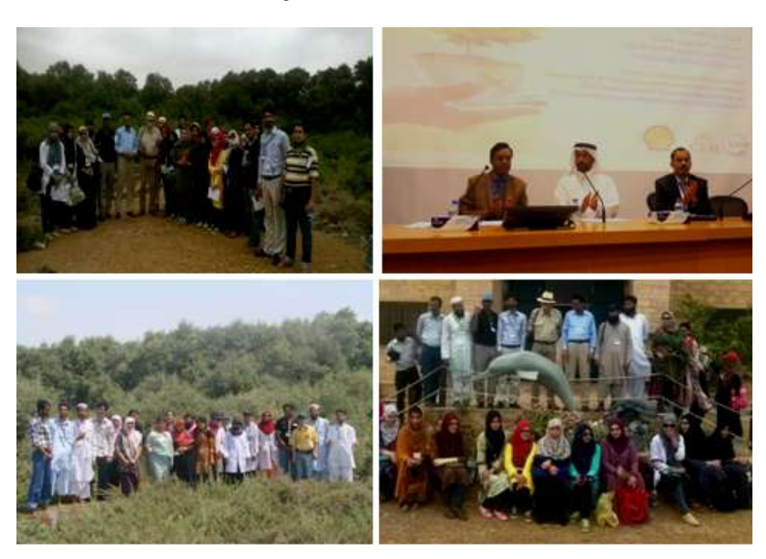
IUCN CEM Regional Activities at Karachi and Doha, Qatar.