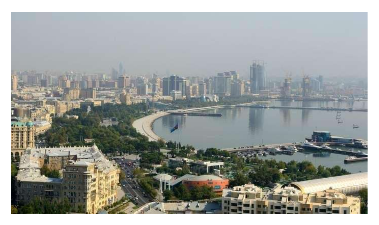
Baku. View from the Mountain Park.

Baku is beautiful place to visit. It is city where you can enjoy walking in downtown, boulevard enjoy coffee or Azeri tea with local sweets. The city is a blend of old and new architecture, lots of parks to chose from, Food is excellent, people are friendly, and very safe place for international visitors.