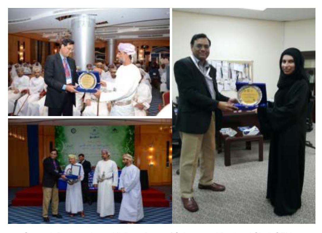
Souvenir Presentation to Minister, Dean of Science and Regional Chair CEM.