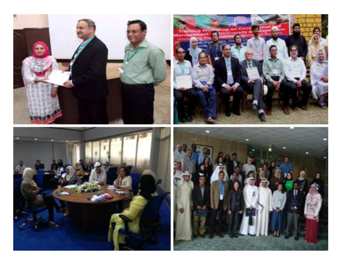
IUCN CEM Regional Activities at Karachi and Kuwait.