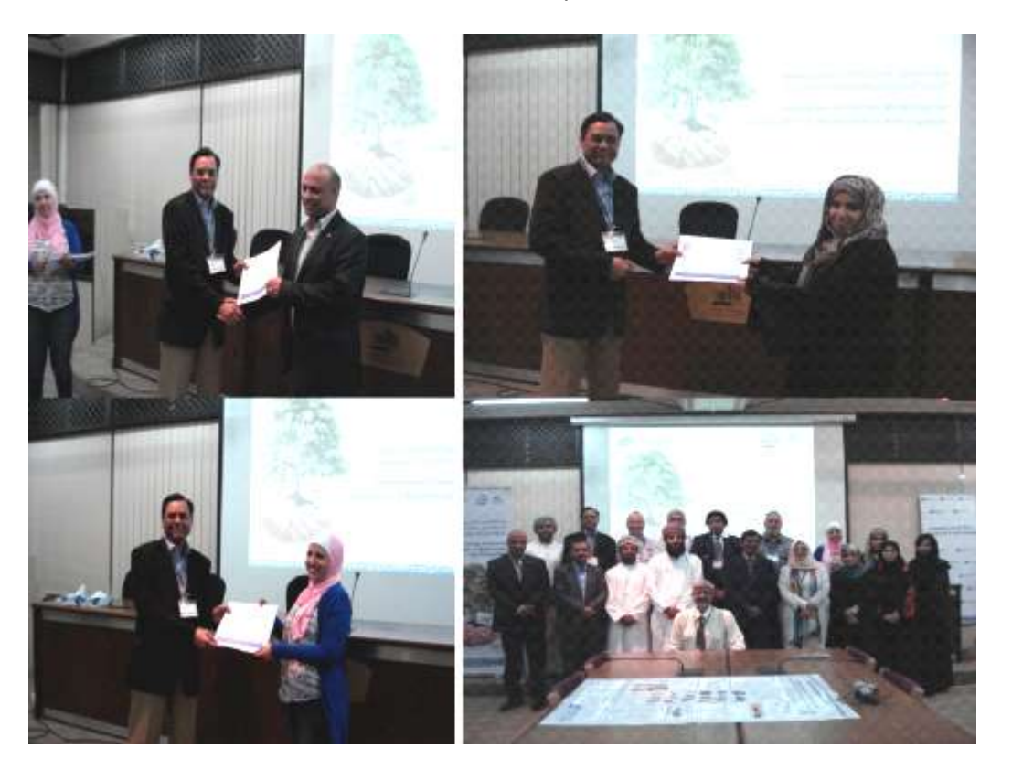
Certificate Distribution Ceremony.