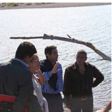
Field visit to the Buna River Protected Landscape