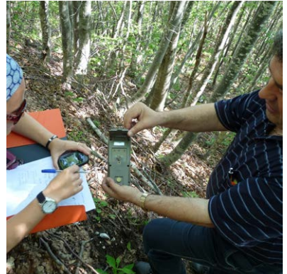
Setting camera traps in Shebenik-Jabllanicë National Park