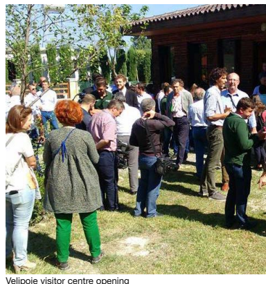
Velipoje visitor centre openin